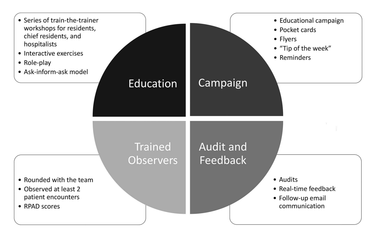
Figure 1. Patient Engagement Project (PEP) Study 4-part education bundle. The PEP educational intervention was delivered independently to the medicine and pediatric services at teaching hospitals at Stanford University and the University of California, San Francisco between November 2014 and January 2015.