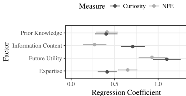
Figure 2: Study 2 model coefficients ( \pm 95% CI) for each factor, from regression analysis predicting NFE & curiosity.

Thompson scores were extracted for use in a simultaneous regression predicting NFE and curiosity. This regression model included prior knowledge, expertise, information content, and future utility as fixed effects, along with a fixed effect for dependent measure (NFE vs. curiosity, effects coded). The interactions between each factor and the dependent measure were also included as fixed effects. Random intercepts were included for participant and item. This analysis revealed a significant interaction between factor score and dependent measure (NFE vs. curiosity) for three factors: expertise, b = -0.12 , 95% CI [-0.19, -0.05], t(1351) = -3.26 , p = .001 , information content, b = 0.20 , 95% CI [0.11, 0.28], t(1351) = 4.42 , p < .001 , and future utility, b = 0.18 , 95% CI [0.08, 0.27], t(1351) = 3.64 , p < .001 . These results (illustrated in Figure 2) indicate that expertise is a stronger predictor of NFE than of curiosity, while information content and future utility are stronger predictors of curiosity than of NFE. While the interaction between prior knowledge and dependent measure was not significant, the regression coefficient for prior knowledge was significant, b = 0.40 , 95% CI [0.30, 0.49], t(974.30) = 8.21 , p < .001 , indicating that prior knowledge was modestly predictive of both curiosity and NFE.