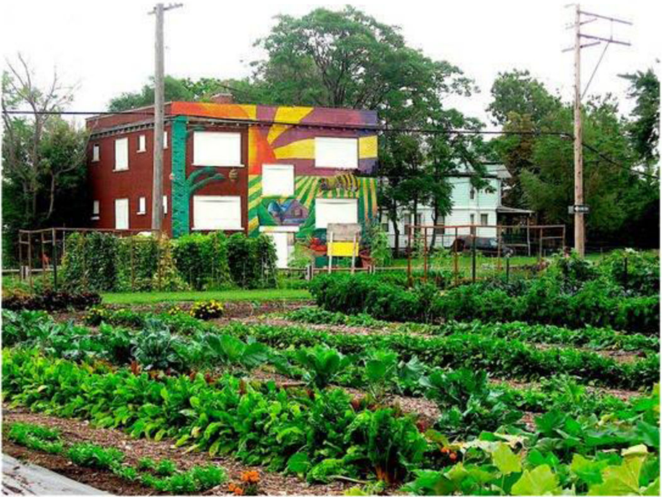
Figure 3. Farm landscape in Detroit that demonstrates growing food in the city with a mural of an urban agrarian landscape on the side of a boarded structure that depicts themes of social activation (home/farm buildings), food security (baskets of produce), ecosystem services (pollinator), and hope (large rays of light emanating from a sun). (Photo credit: Stephanie Held, Detroit Daily).