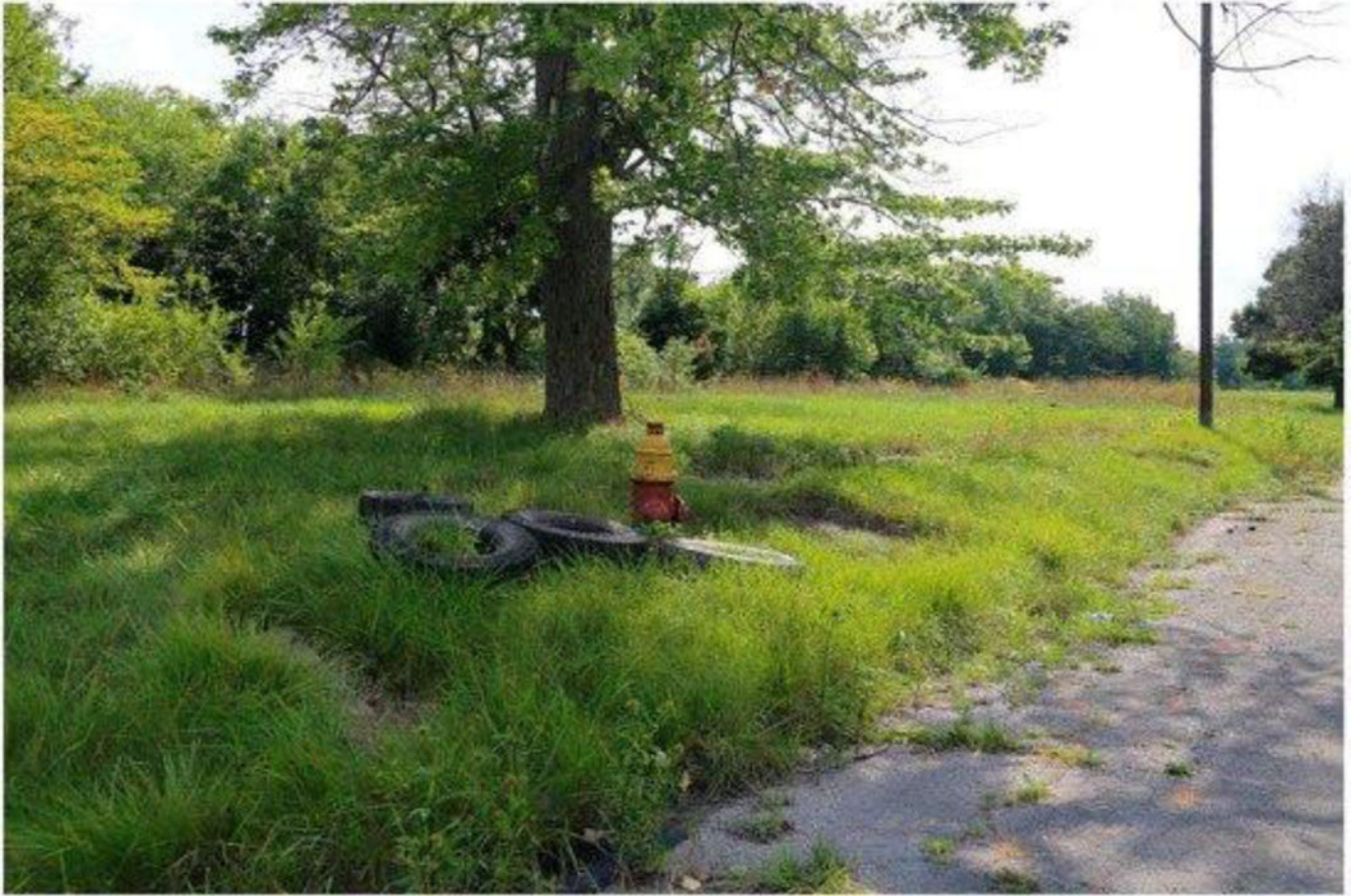
Figure 2. Detroit street where structures no longer exist because of demolition; evidence of neglect (e.g., unmanaged vegetation growth) and undesirable uses (e.g., refuse dumping) persist after demolition. Vacant urban land in shrinking cities is extensive and presents an opportunity for natural resource management for social and environmental benefits.