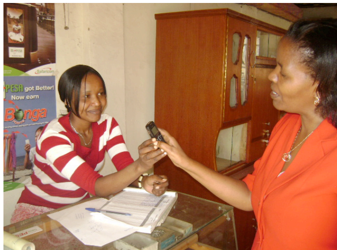
An M-PESA outlet owned by a member of women's group

However, there were some challenges, in relation to the M-PESA services, that the women highlighted. Although there were numerous challenges mentioned, the groups made it clear that there were more positive aspects of using M-PESA services than there were negatives. One respondent put it this way, “The positives are more than the negatives.” For now, this working paper will only focus on the select few which were most frequently described in the discussions. These included: fraud, network problems, cost, services for special populations and group communication dynamics.