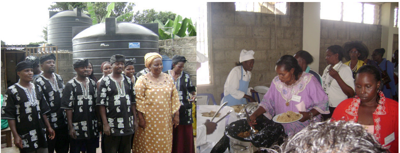
Member of VwAG with employees of catering business

In terms of process and structure, a key session of the workshop was entitled, 'Women's Voices.' Nine of the 21 women's groups had been pre-selected, based on geographic region and diversity of group objectives/goals, to do presentations of their overall approaches to poverty reduction, within their families and communities. This was complemented by VwAG group modeling one of their member's catering businesses. Primarily established through the Merry-Go-Round and financial investments of VwAG, this member's business has expanded to over 100 employees, catering for some of the largest corporations in Nairobi. The VwAG member, through her business, catered for the workshop. The session on 'Women's Voices,' was followed by a discussion of the preliminary findings from the research on mobile money services, with a response from the service providers and policymakers.