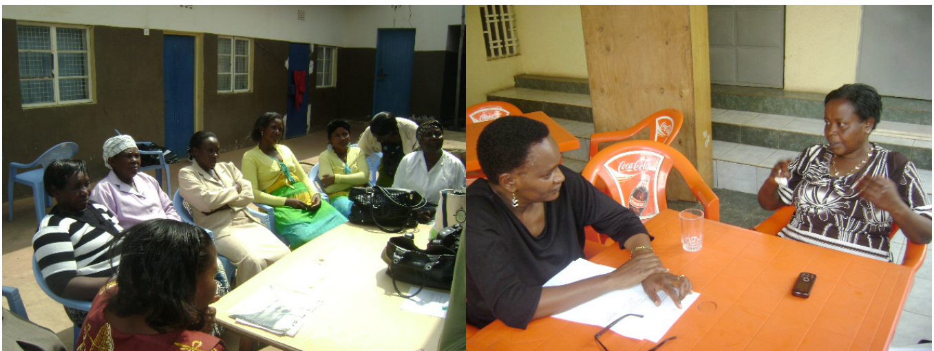
Focus Group Discussion in Wamunyu, Kenya

The methodology included in-depth interviews, focus group discussion, participatory observations, review of secondary data and a dissemination workshop, which will be the focus of this working paper.