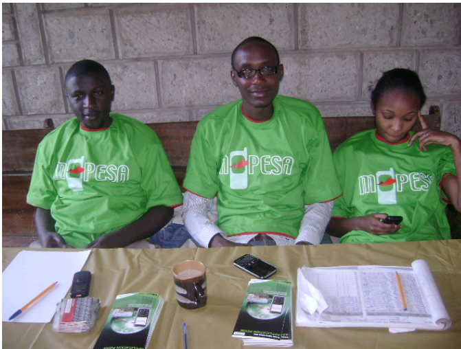
M-PESA staff provides women's groups with services