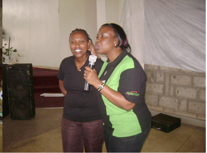
M-PESA staff address challenges