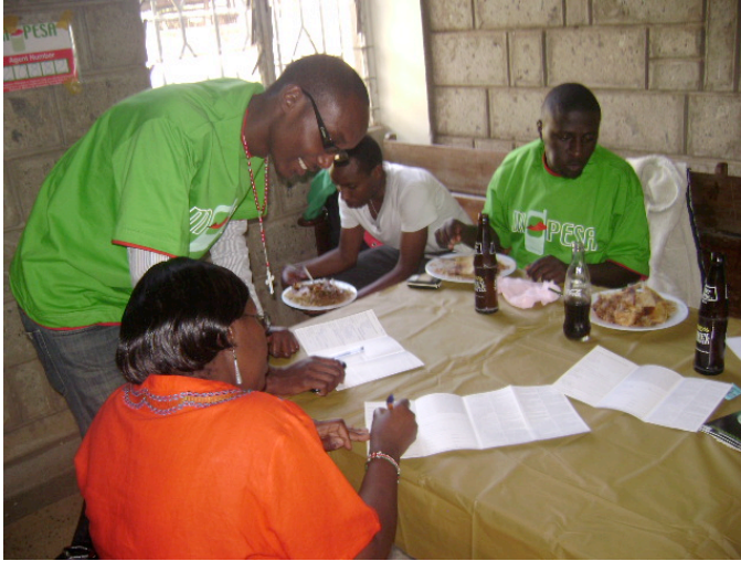
M-PESA staff helped women register for new services

Since this issue relates more to the training and capacity building carried out by VwAG, it was not addressed by the M-PESA in detail. VwAG did highlight and discussed it during the workshop. They encouraged members not to allow the use of technology to erode or limit their face to face interactions and communication by not attending meetings.