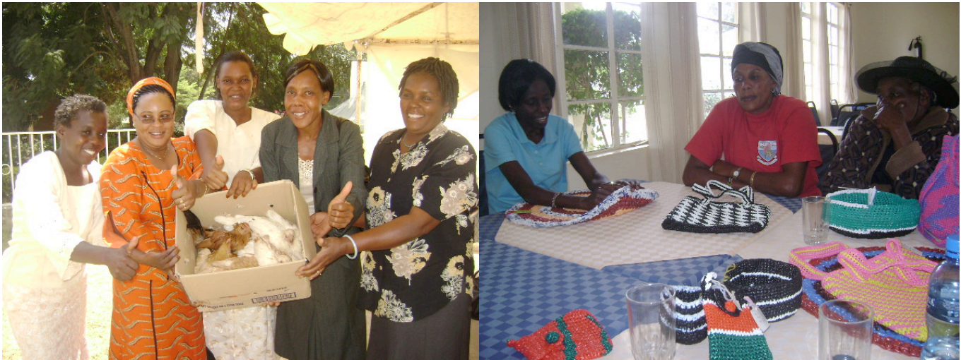
Women's Group hold up poultry raised for income