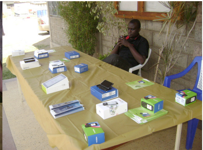
M-PESA staff sells market and sell products