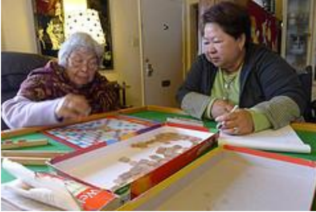
Domestic Care Worker providing crucial care work in the resident's home.