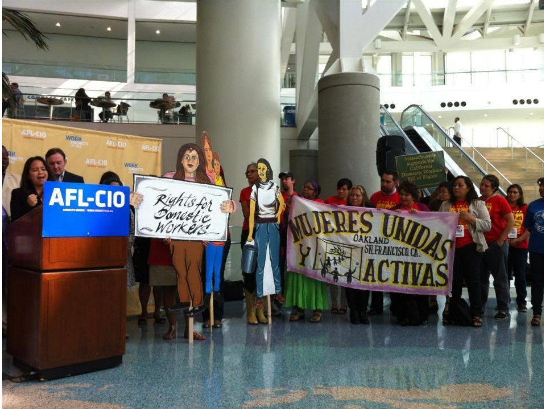
Domestic Workers and AFL-CIO hold a press conference celebrating lobbying and success of AB 241 at the California Legislature in Sacramento, CA October 12, 2013.