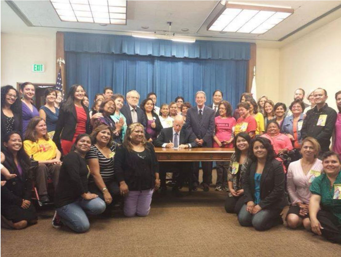
Governor Jerry Brown signs the California Domestic Workers Bill of Rights (AB 241) into law on September 26, 2013.

Part one summarizes the provisions in enacted bills of rights with a focus on enforcement mechanisms. Part two updates the legal status of the revisions of the Obama administration that would extend FLSA protections to home care workers employed by third parties and redefine “elder companion” and “care” so to end the exclusion of these workers from overtime. Part three presents laws and policies from other nations, which suggest the range of arrangements that different political economies establish to define labor markets for household work. It also summarizes the ILO convention. Part four assesses models of enforcement: civil litigation; state agency (Department of Labor, Attorney General, and/or Human Rights); state employment bureau/public authority; worker center/NGO; and worker ambassador/grass roots monitoring. Some of these approaches overlap; all of them contain elements that together can enhance the rights of workers and employers of household labor.