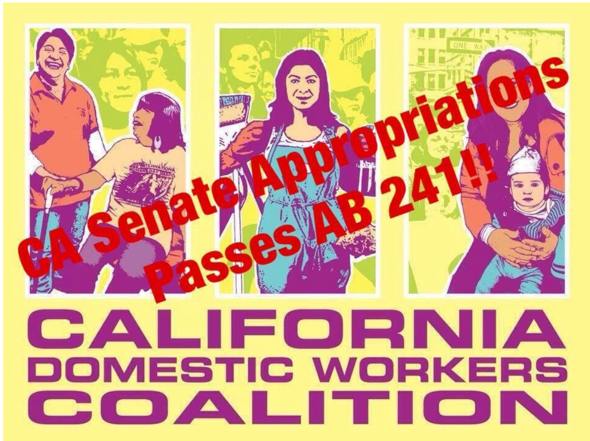
Caption: Campaign poster from California Domestic Workers Coalition, September 2013.