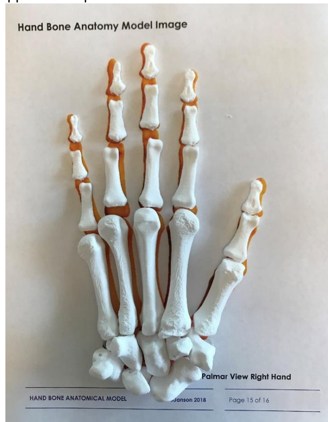
Figure 2: Hand bones in anatomical configuration on reference page.