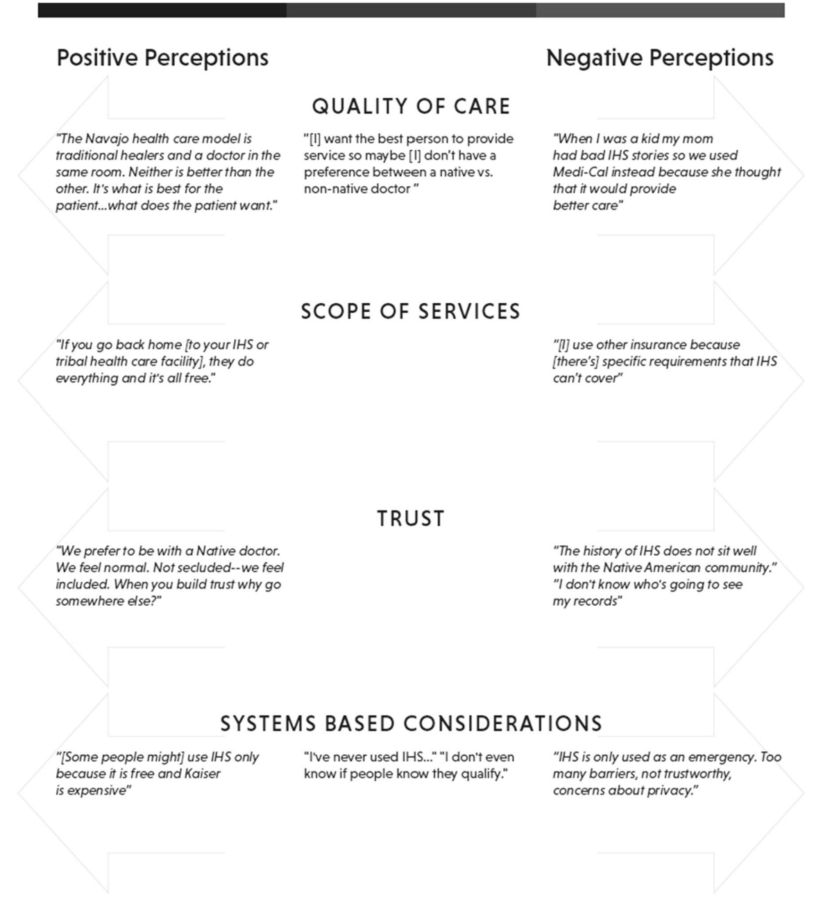
Fig. 1 Range of participant perceptions about the use of the Indian Health Service and Culturally-Specific Health Care

local providers, this again underscores the importance of having culturally appropriate care available and trauma-informed environments that people can go to address or alleviate these common problems and concerns.