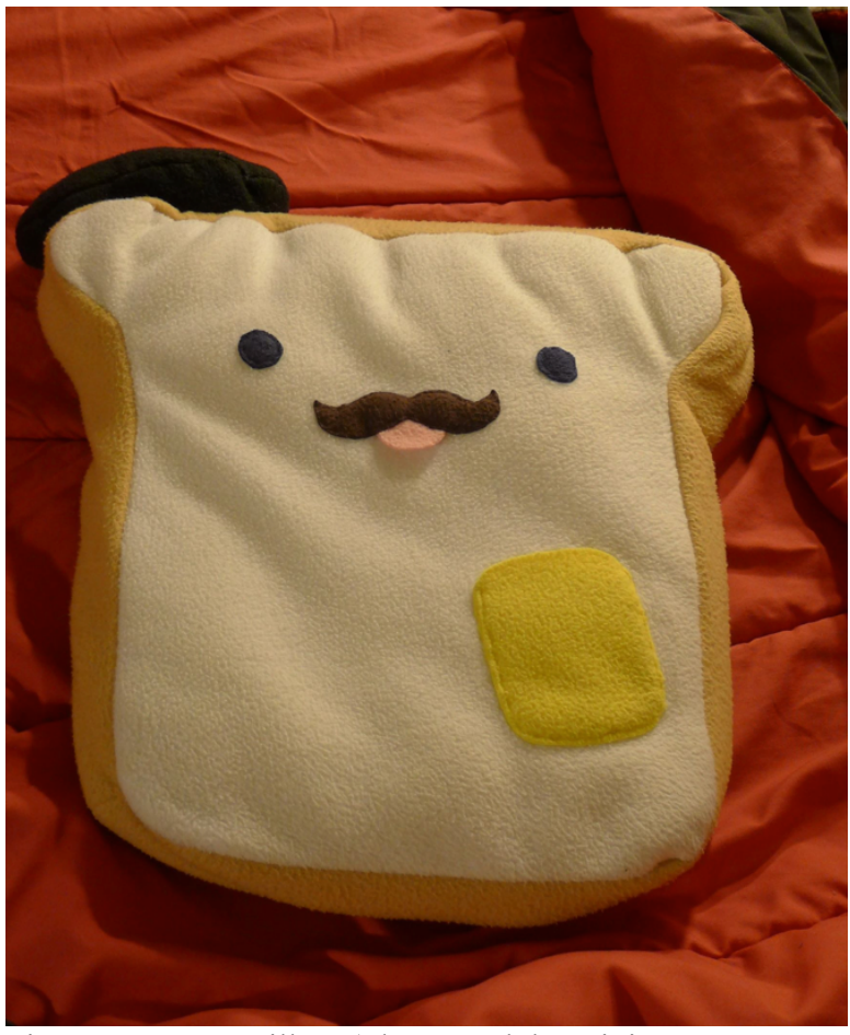
Figure 3-7 Toast Pillow