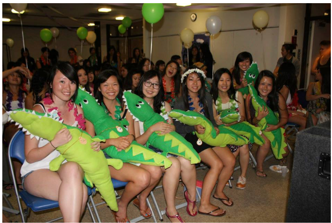
Figure 3-4 Alligator pillows, yr. 2013. (Chi Alpha Delta Facebook)

sorority sisters, continuing Chis' shared crafting identities as remarkable as the objects they craft.