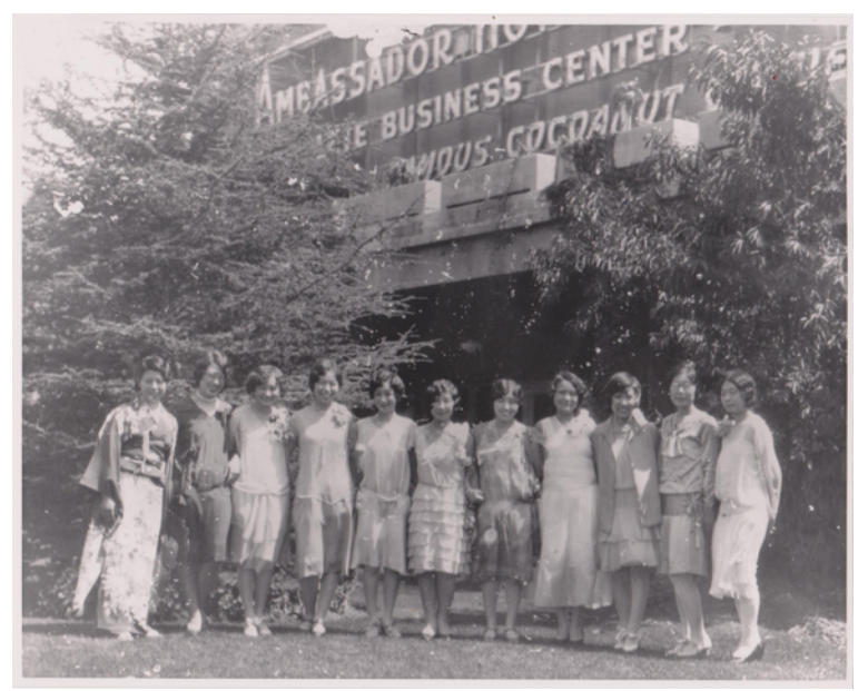
Figure 2-1 Chi Alpha Delta Charter Class (dated 1929)