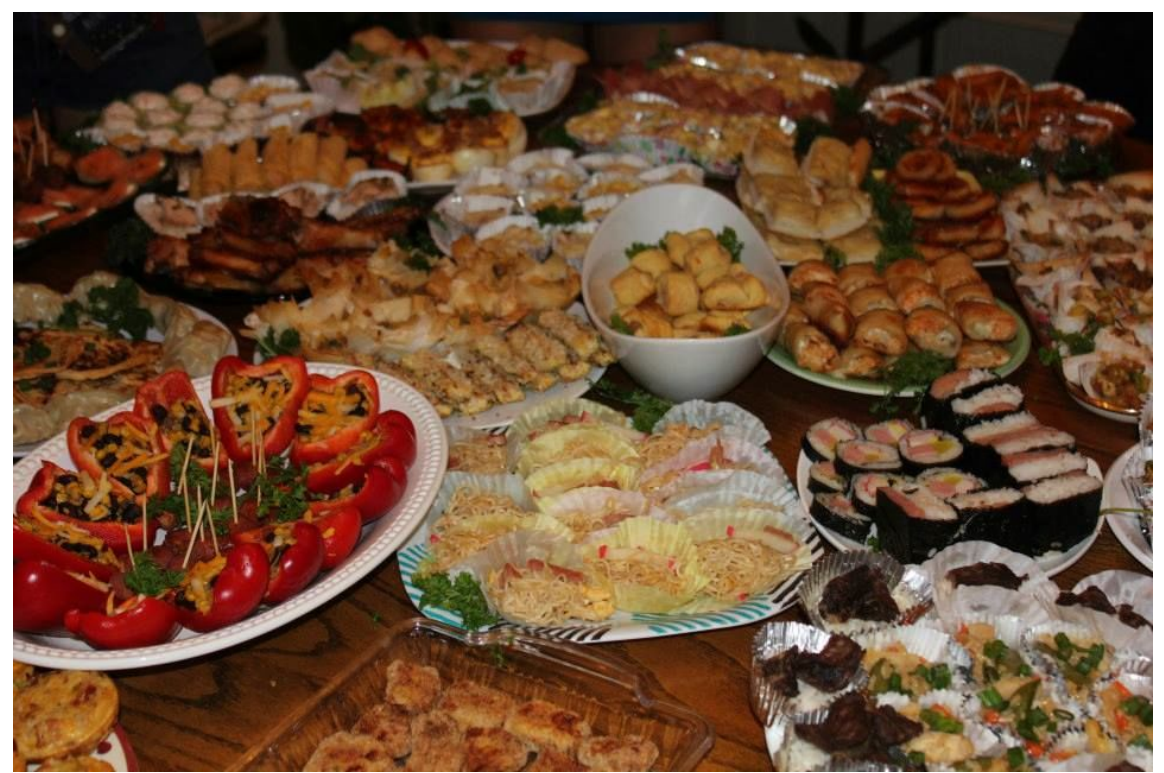
Figure 4-2 Home-cooked Food prepared for Social Night, Rush Week 2013