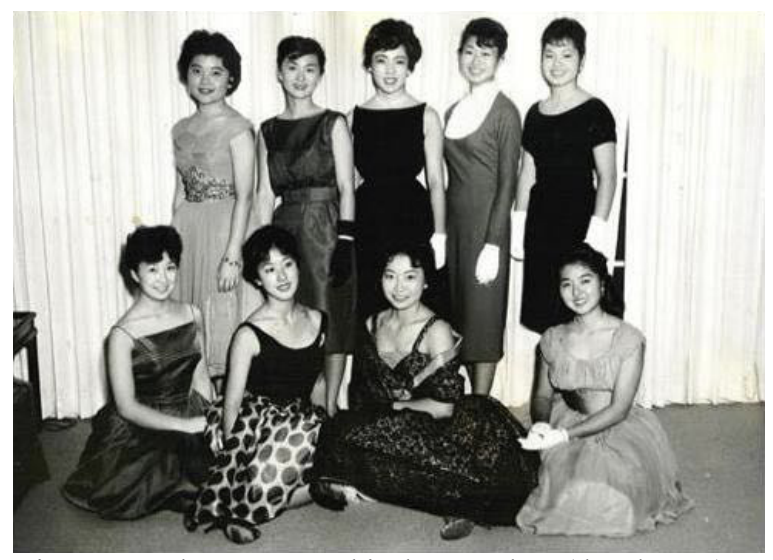
Figure 2-3 Theta Kappa Phi Charter Class (dated 1959) (Theta Kappa Phi Alumnae Website)

Increasingly in the later half of the twentieth century, Chi alumnae and Actives are Asian American women with heritages from East Asia and Southeast Asia who are the second to fifth generations of their families in the United States, as well as Japanese American and mixed-racial and ethnic-Asian identities. Women with Vietnamese heritages whose families (their parents) were refugees and came to the United States during Vietnam's collapse into civil war and the aftermath of the Vietnam War are the most well represented ethnic-Asian group in the last decade, although Korean, Thai, Chinese, Taiwanese, and Filipina American women continue to populate the Pledge Classes as well. Few Caucasians and Pacific Islanders have joined the sorority, but those racial and ethnic groups are outliers in the organization's history. Theta's Actives in the most recent years are increasingly first or 1.5 generation Asian women who were born abroad, but came to this country as infants or children when their parents immigrated as young adults for further education or economic opportunities, or due to the political strife in their homelands. Overall, the demographics of Chis and Thetas reflect the diversity of