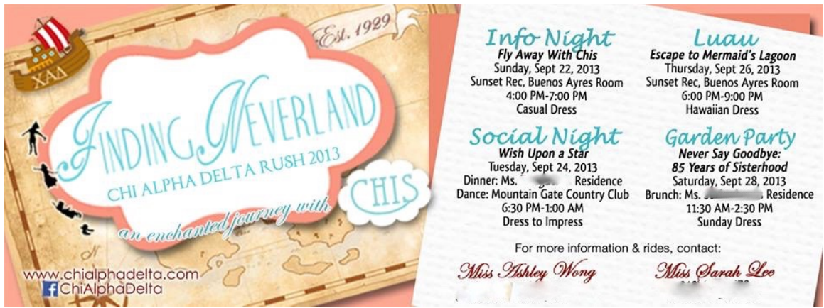
Figure 5-5 Chi Alpha Delta 2013 Rush publicity (Chi Alpha Delta Facebook)

Since I told the young Chi Actives and Pledges when I first met them at a sorority House general meeting I was interested in the history of the sorority, many of the Chis I interviewed later said I should look at their scrapbooks or asked if I had seen them yet. The sorority creates one scrapbook each year to document and commemorate the social activities and occasions it celebrates every year. These scrapbooks are like a family photo album, high school yearbook, and mementos from a keepsake box merged into one, and include many charming craft elements on its pages and cover for which the Chis are well-known. These books are elaborate, sentimental, and some are oversized so that they cannot be held in one's hands and are instead looked at the tables where they are