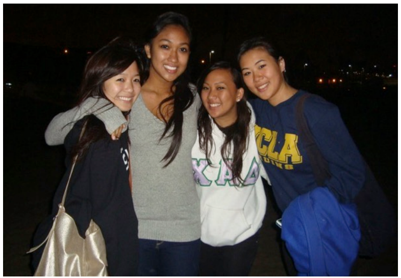
Figure 2-5 Chi Alpha Delta Sorority "letters" (center)