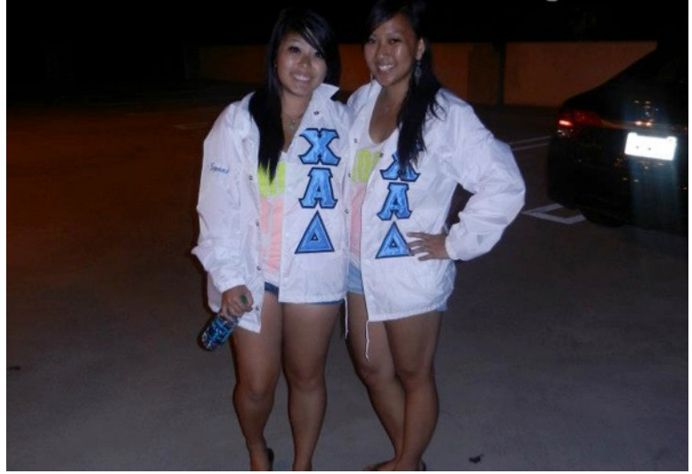
Figure 2-6 Young and Dangerous Family Line Jacket