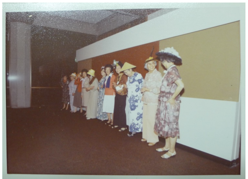
Figure 5-1 Chi Alpha Delta Charter Members, 50<sup>th</sup> Anniversary Dinner, yr. 1979