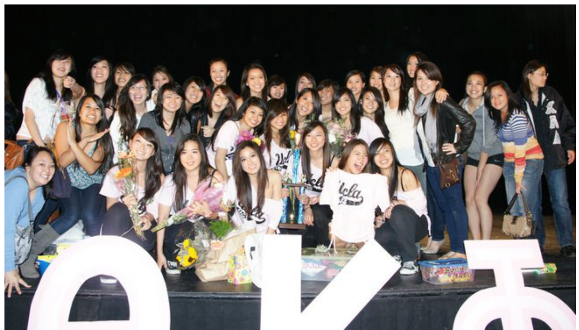
Figure 1-2 Chi Alpha Delta sorority with the first place trophy, 2011 Theta Kappa Phi Annual Battle of the Pledge Dances. (Chi Alpha Delta Facebook)