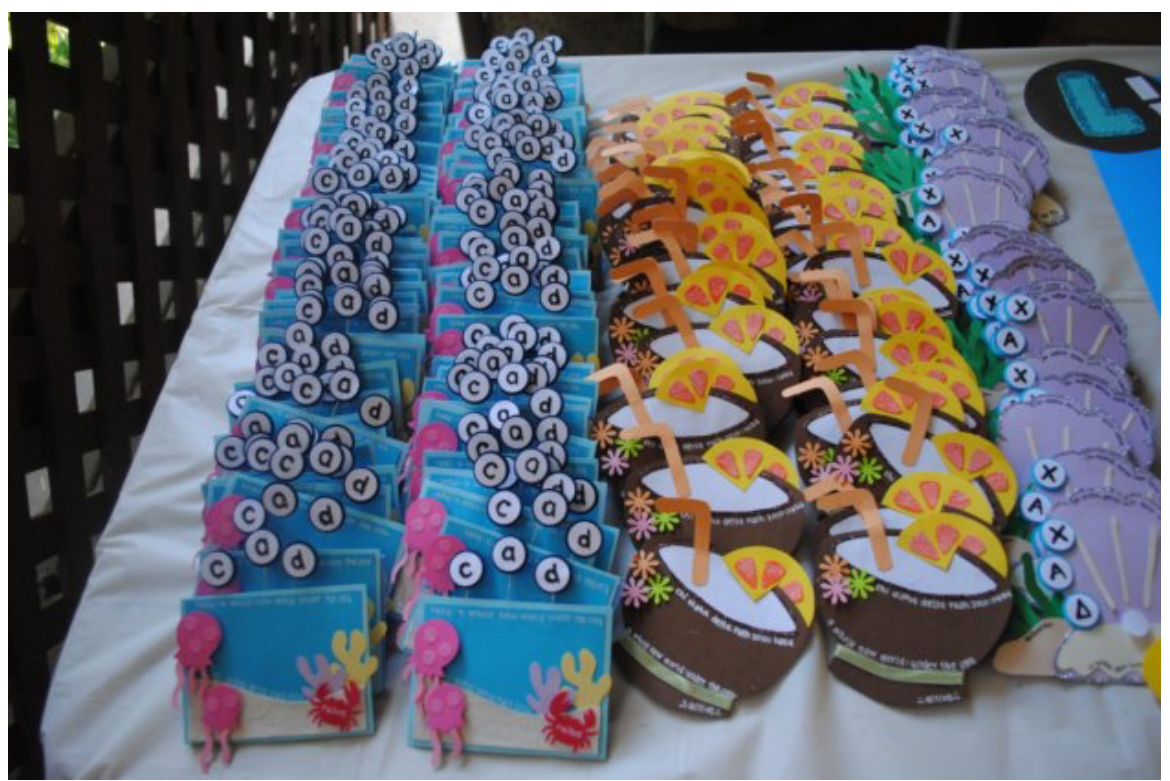
Figure 3-1 Chi Alpha Delta Rush Nametags, yr. 2010.