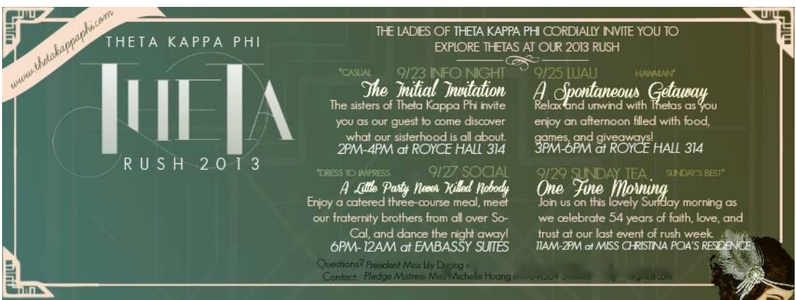
Figure 5-4 Theta Kappa Phi 2013 Rush publicity