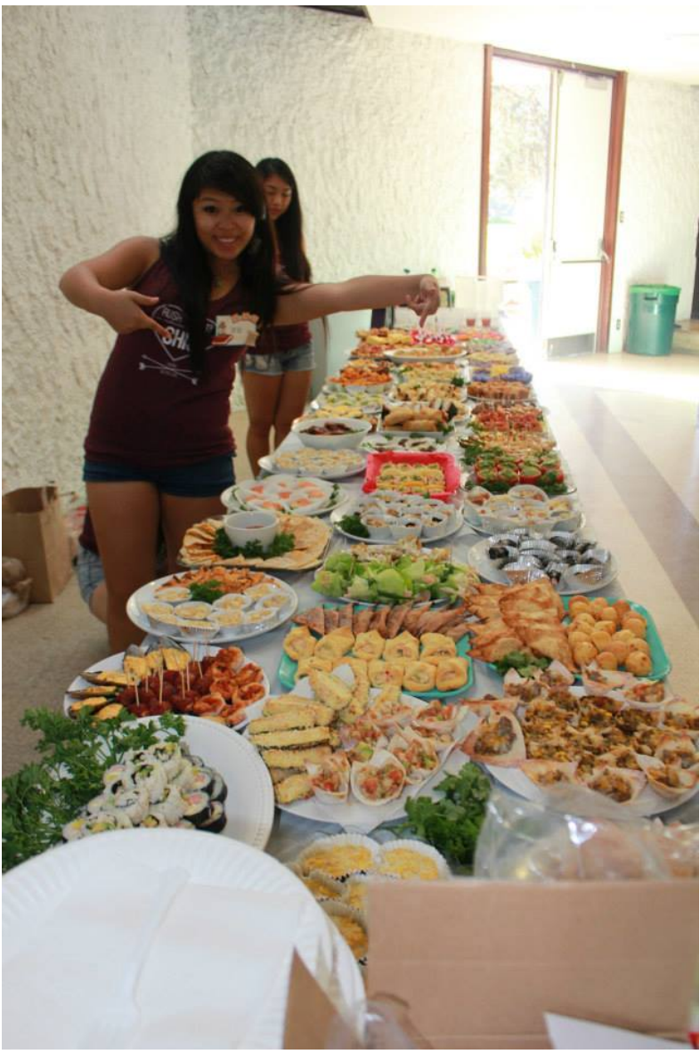
Figure 4-3 Buffet table, Information Night, Rush Week 2013