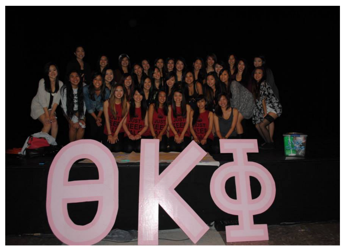
Figure 1-1 Theta Kappa Phi sorority, 2014 Theta Kappa Phi Annual Battle of the Pledge Dances.

and becomes the legacies in body and spirit and embodiements of the community. The affective archives of Chis and Thetas are not only personal belonging and sentimental objects, but they are also the affects of sisterhood—intimately moving and profoundly touching. The sorority archives of Chi Alpha Delta and Theta Kappa Phi exist in the familiarity of sisters. The archives are palpable in their presence: mass/en masse/amass in body and spirit, forming social kin. They compose and contain the knowledge of sisterhood: its repertoires, inheritances and legacies as the gifts—giving and receiving— of belongings that form the rings of familial "homes."