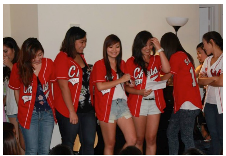
Figure 2-4 D.L.D. Family Line Shirts

In addition, Pledges get "two sets of letters" as new Actives of the sorority who are also called Neophytes in the Greek system: clothing and other material objects (e.g., towels and duffle bags were the most frequent example I saw) with the sorority colors and family colors, which are mutually exclusive when the emblems are manifested on clothes: i.e., an item of clothing either has the sorority's letter in the sorority's two colors or another two colors of the sorority family, but not two sets of letter on the article of clothing making four different colors.<sup>83</sup>