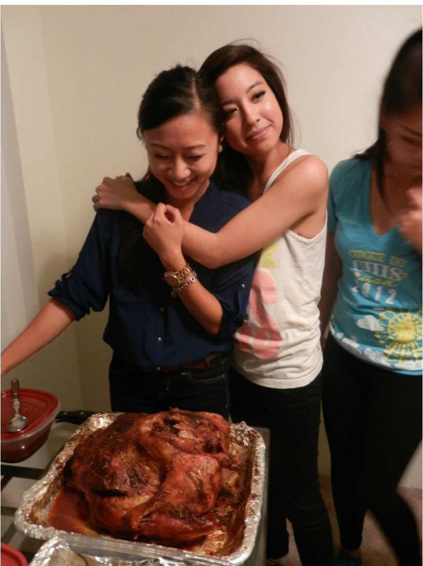
Figure 4-5 Turkey, Chi Thanksgiving Dinner, 2012 (Chi Alpha Delta Facebook)

followed. Moreover, they certainly seemed kept in recent years, in concordances to the Chi turkey tradition—and with pleasing results, if one would like to judge from the pictures below.