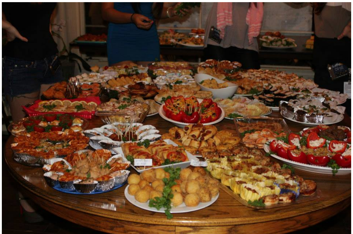
Figure 4-1 Buffet Table, Social Night; Rush Week 2013