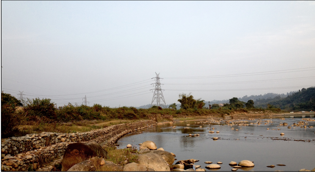
Figure 2: Transmission lines in Mipubasti, Arunachal Pradesh, exporting hydroelectricity from the Ranganadi HEP.