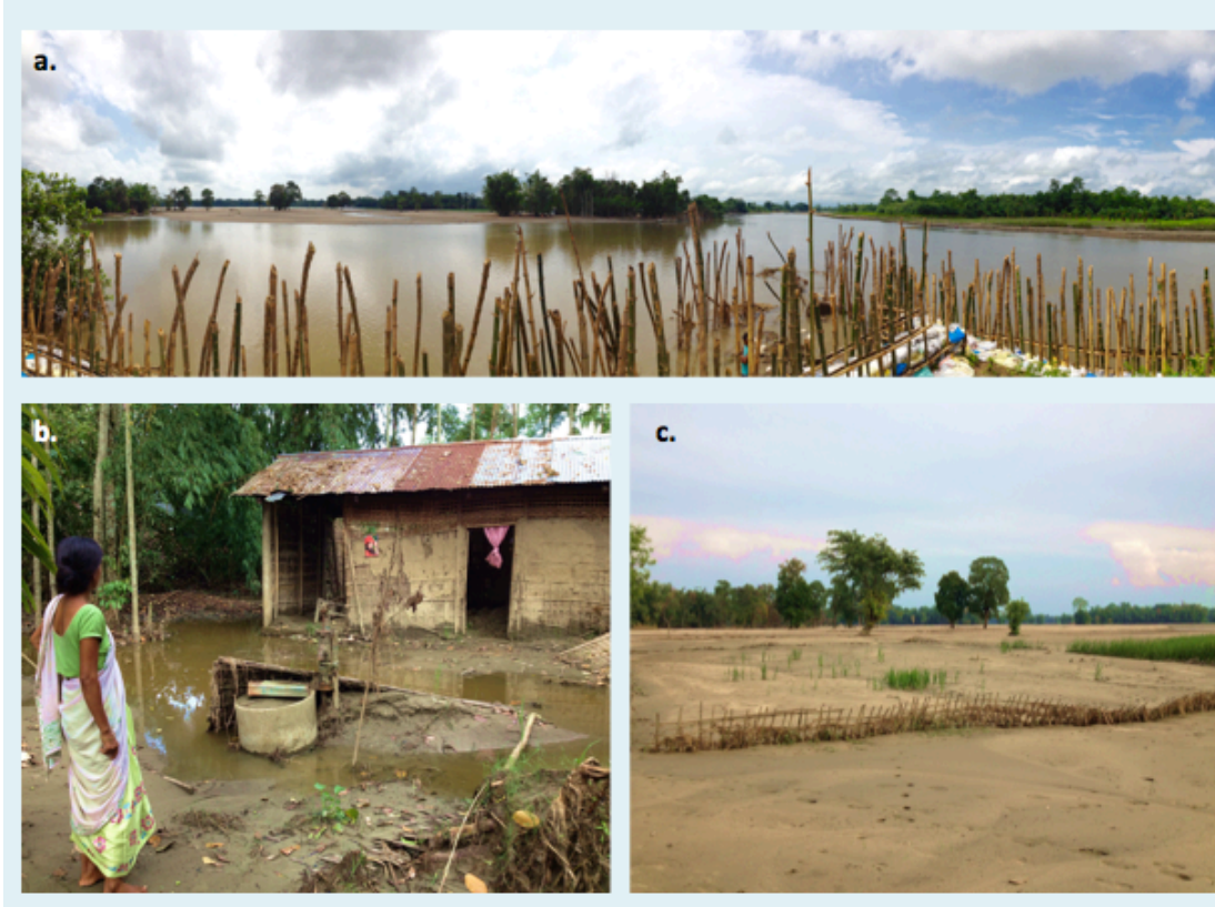
Figure 1: Flood impacts downstream of the Ranganadi HEP in Possim Kharkati, Assam. (a.) On the right, the Ranganadi river flows along its main stem. In the middle, bamboo and sandbags protect what is left of the embankment after it breached on August 14 th , 2014. On the left, stagnant floodwaters and sand submerge rice fields and a large communal fishpond. (b.) An Assamese woman looks at her house destroyed by floodwaters after the embankment breached. (c.) Large amounts of sand cover rice fields after the flood.