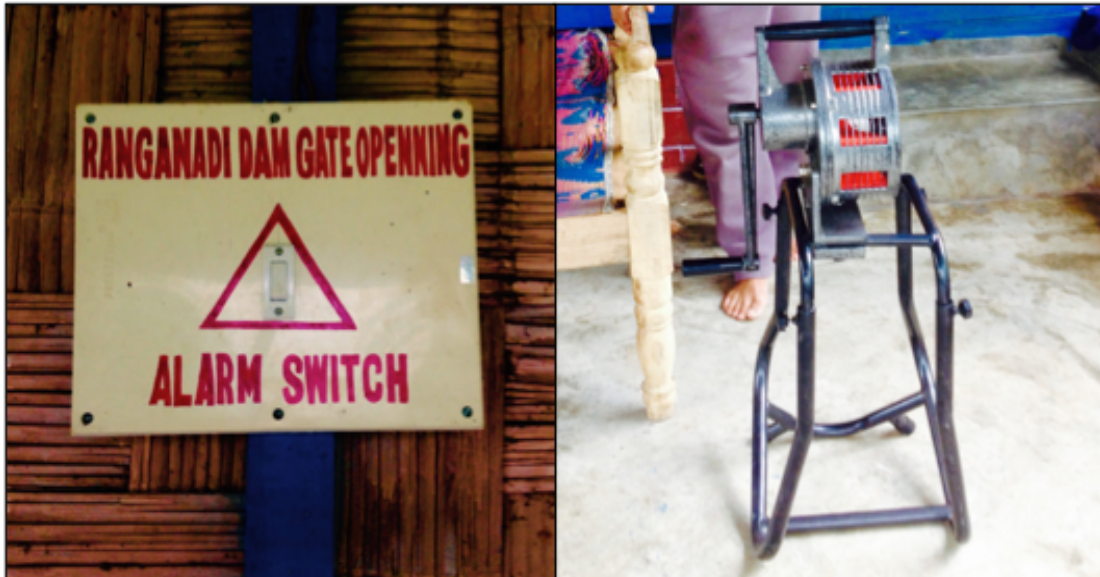
Figure 3: Ranganadi water release notification system in Lichi village, Arunachal Pradesh. Electric switch activating sirens (left) and manually operated siren (right).

receiving a call from NEEPCO officials, appointed villagers must activate the sirens using a switch located in their household. Since public telecommunications infrastructure and power stations often experience damages and failures in times of floods, the villagers have also been equipped with a manual siren (see Figure 3).