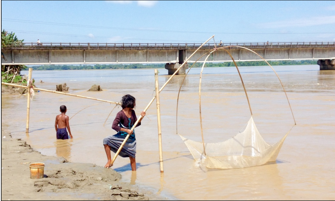
Figure 1: Children fishing in the Dikrong river, a tributary of the Brahmaputra, in Assam.