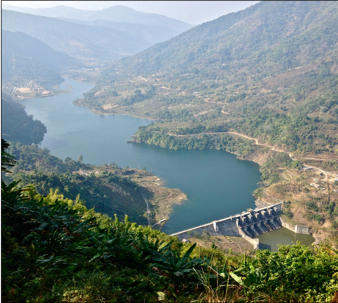
Figure 1: The Ranganadi Hydroelectric Project (405 MW) dam near Kimin, Arunachal Pradesh.