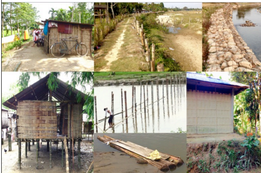
Figure 4: Adaptation methods against floods and impact of Ranganadi HEP on those methods. Top left to bottom right, column-wise: Flood-affected households relocated temporarily on the road after the 2014 summer floods, a stilted house in a Mishing village, an embankment reinforced with bamboo and wood, a man building a bamboo bridge, a banana raft, a floodwall, a raised Assamese house.

1 Remained within 2km of riverbank 2 Not including floodwalls