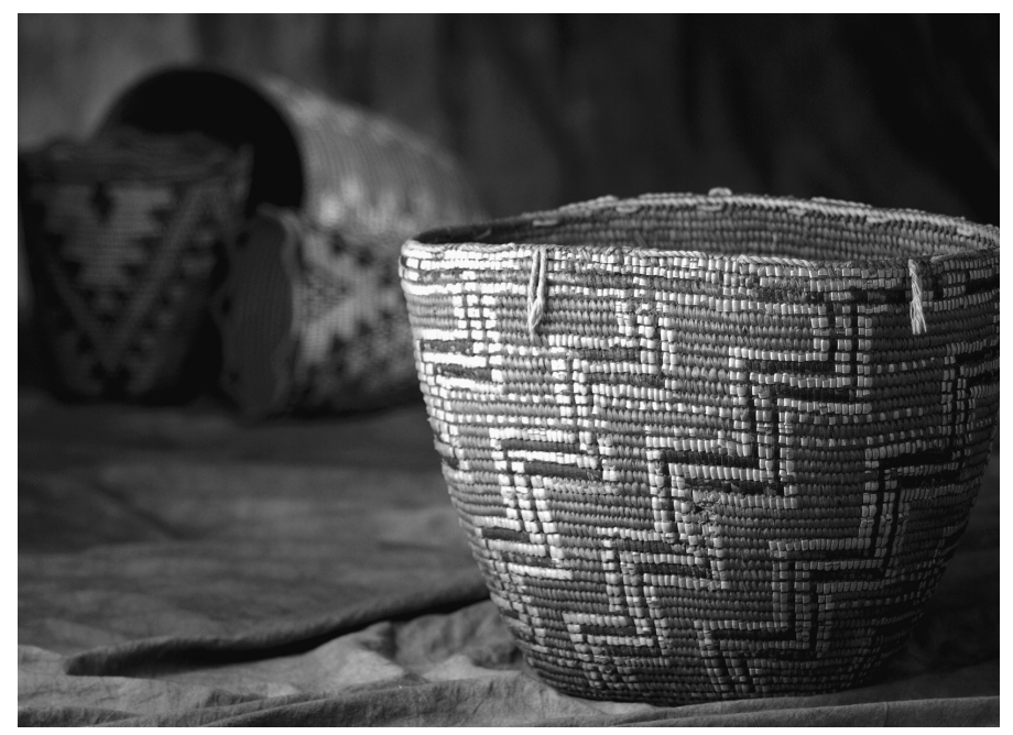
FIGURE 3: Patrice Hall-Walters (2009). Photograph of a basket from a private collection.