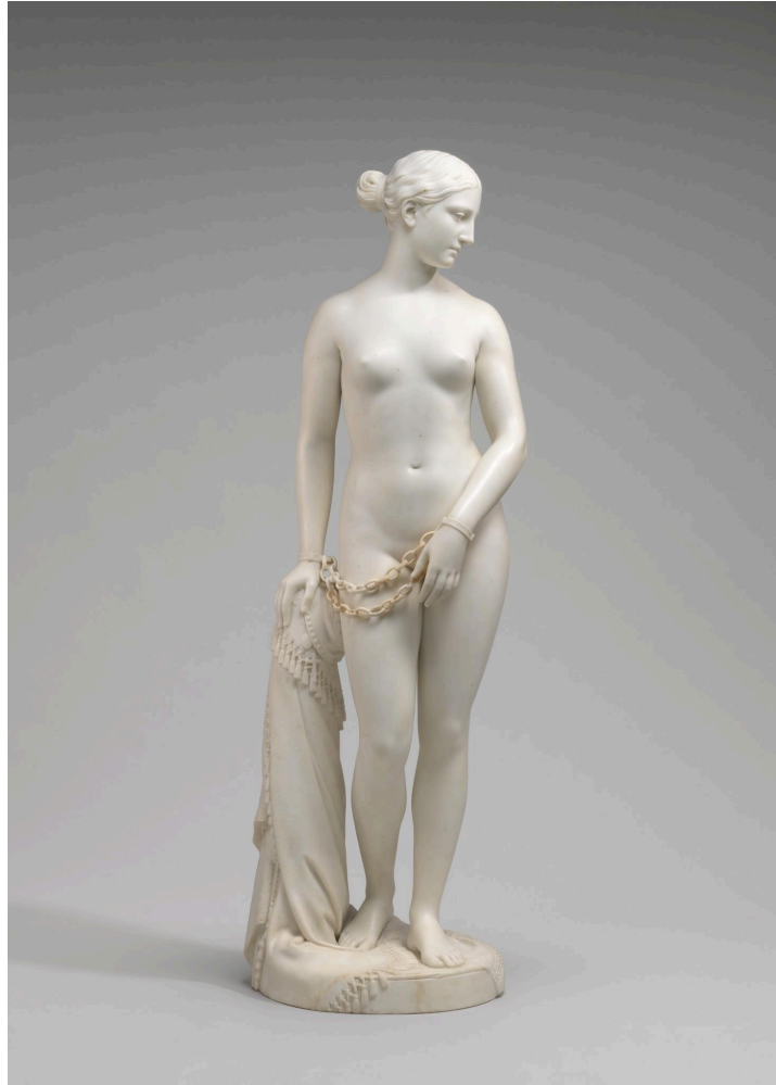
Figure 2. The Greek Slave captivated American and international audiences for her striking nude figure, paired with her poignant facial expression and submissive posture. (Powers, Hiram. The Greek Slave . Modeled 1841-43, carved 1846. Marble. National Gallery of Art, Washington D.C.)

Alcott finds the idea of attraction to a marble woman salient enough to explore in multiple tales over a period of years. It's unlikely that Alcott's understanding of statues as loci of erotic attraction came directly from Kaan's Psychopathia Sexualis , but there are several probable American inspirations for this exploration. Alcott's idea of the marble woman has similarities with The Greek Slave ; for her, statuesque women are obedient, docile women who perform their duties silently and beautifully, yet ask nothing in return. In characterizing her marble women, she