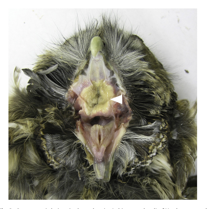
Fig. 3. Caseonecrotic lesions in the oral cavity (white arrowhead) of Northern spotted owl ( Strix occidentalis caurina ) CA005578 recovered during an avian trichomonosis mortality event involving band-tailed pigeons ( Patagioenas fasciata monilis ) in Marin County, California during summer 2014.

Lastly, one northern spotted owl was found in Marin County with suspected avian trichomonosis and was admitted to WildCare (San Rafael, CA) during winter 2014–2015. Owl CA013335 was