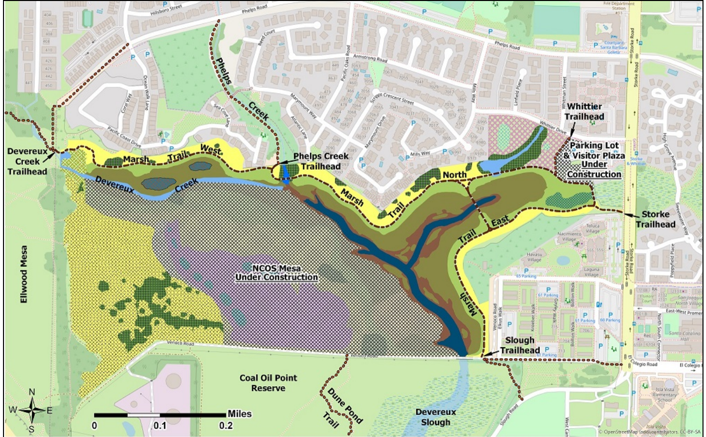
Map of the Wells-Elings Marsh trail at NCOS and connections to other trails and the surrounding area.

We are excited to open much of the restored North Campus Open Space, trails and bridges to the community. And we are also a bit nervous since construction and restoration work is still in progress. There will be vehicles on site, and the newly planted seedlings as well as the wildlife are sensitive to disturbance.