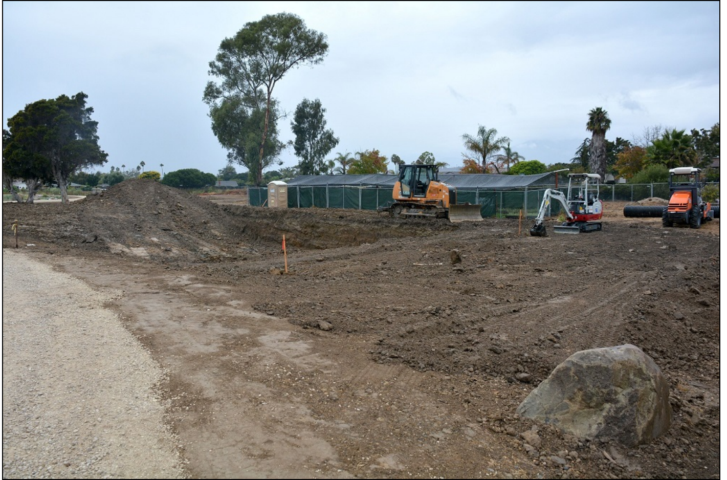
The construction site for the "Gator Barn" at the northeast corner of NCOS.

The construction fence around the perimeter of NCOS will be removed next week. Since construction and restoration work are ongoing, a shorter fence is being installed along parts of the site to help minimize disturbance to wildlife and sensitive habitats.