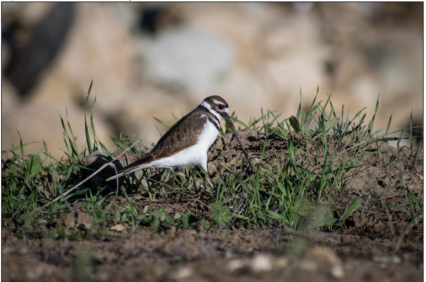
A Killdeer tugs on an earthworm at NCOS.

Wildlife are exploiting the food resources at NCOS, and we've been fortunate to capture some birds in the act, such as a Killdeer snatching a worm and a Red-tailed Hawk enjoying a rabbit lunch (see photo below and click here for a short video ). Starting next week, we hope that you will also be able to observe and experience similar wildlife activity.