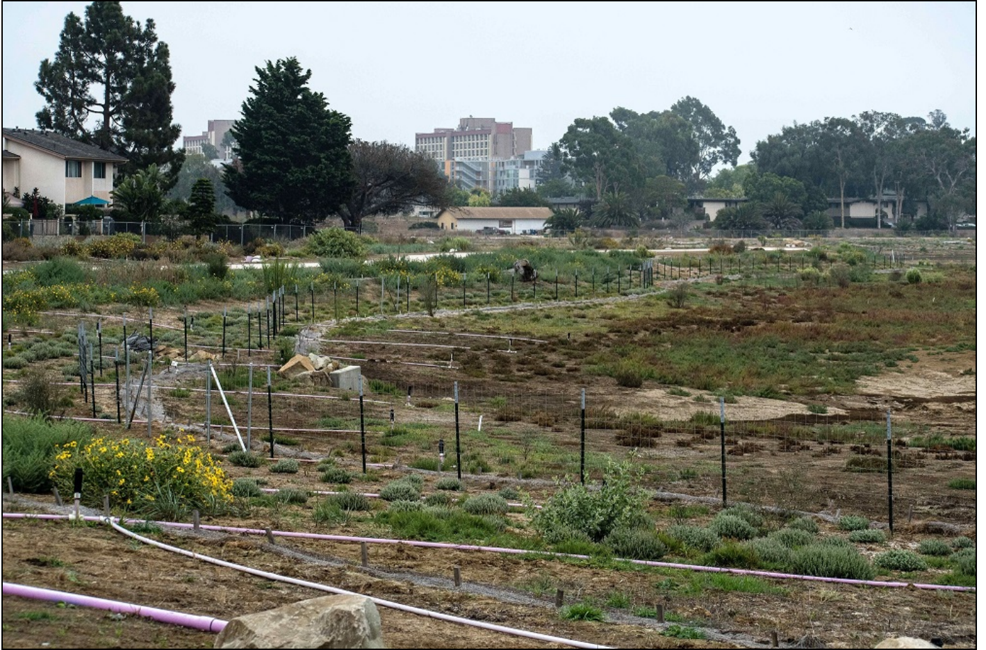
A portion of the habitat fence being installed along some areas of NCOS.