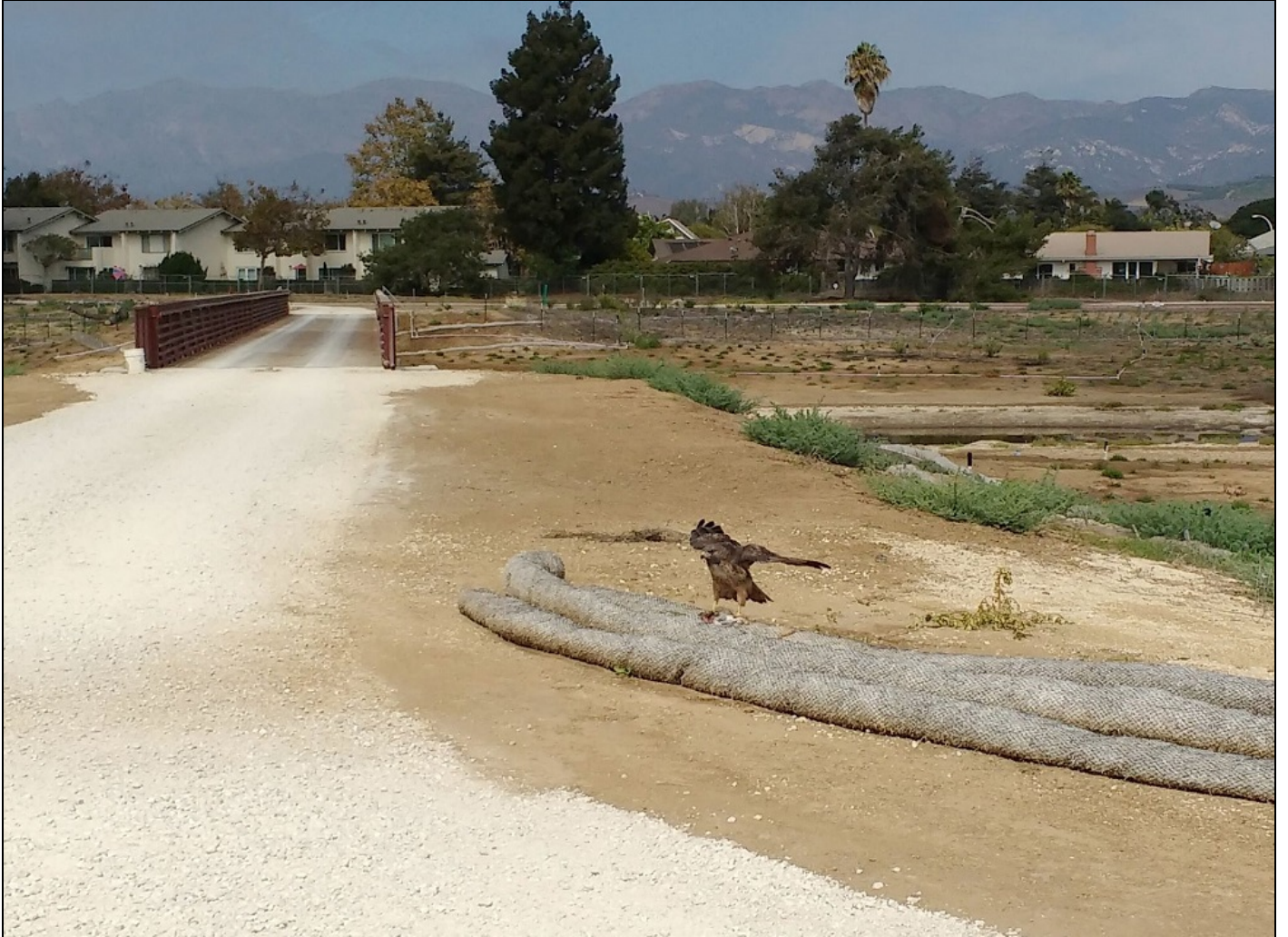
A Red-tailed Hawk protects its freshly caught meal of rabbit by the east channel bridge at NCOS.

Have a plant, wildlife, or other photo of the NCOS project site you'd like to share? We welcome submissions of photos of the project site and/or the adjacent Ellwood-Devereux area to share with NCOS News readers. Please email a photo you would like to share along with a brief description to ncos@ccber.ucsb.edu .