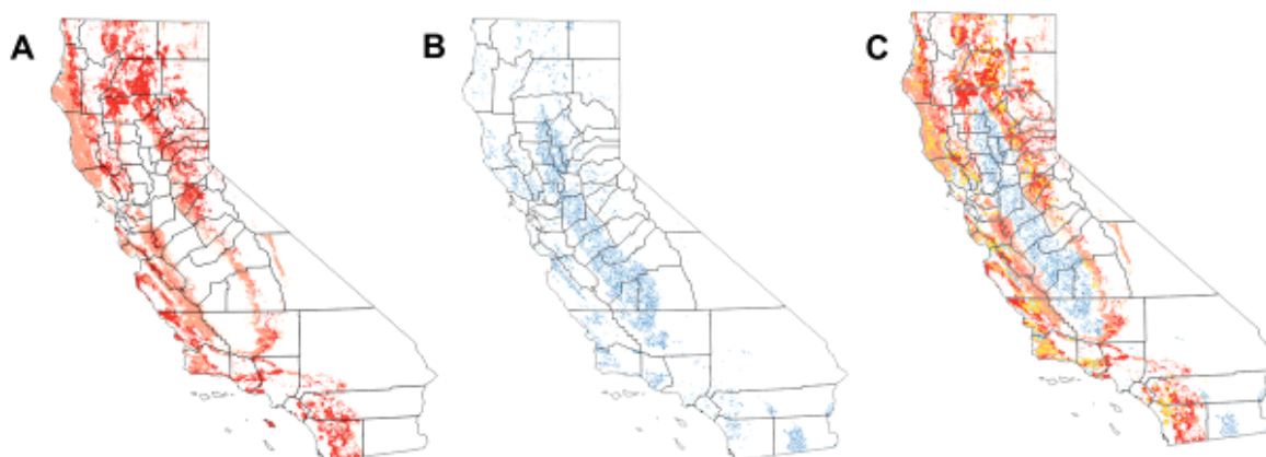
Figure 1. There is overlap between regions at risk for wildfires (A) and regions where pesticide is applied (B). Overlapping regions are shown in yellow (C). Maps A and B were created in QGIS using GIS data from CalFire (2007) and CDPR (2015). Map C was created in Adobe Photoshop and regions of overlap were pseudocolored yellow.

combustion products, smoke has the potential to transport these products or the parent compound long distances. Long-range transport of pesticides via wildfire smoke is possible, and may impact human health. Indeed, Genualdi et al. [3] recorded trans-pacific transport of pesticides in wildfire smoke. The authors determined that pesticides were transported from Siberian wildfires to Oregon and Washington in smoke, demonstrating the ability of wildfire smoke to transport pesticides previously applied to land. Based on the pesticide application and fire threat, pesticides can contribute to the composition of wildfire smoke and thus threaten human health.