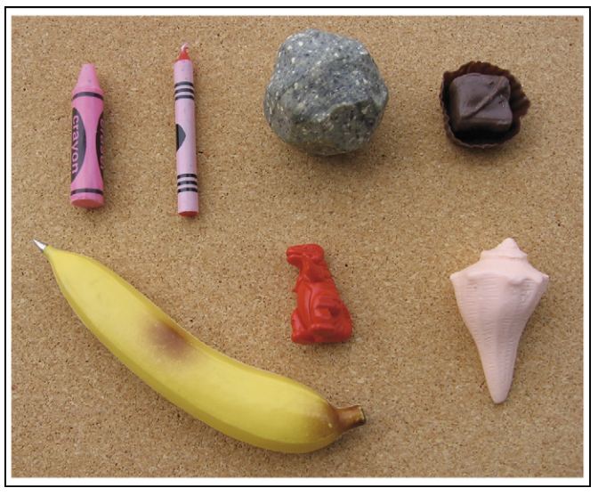
Figure 1. Sample deceptive objects used in AR and flexible-naming tests. Top row: sample deceptive objects used in AR tests. Left to right: crayon eraser, crayon candle, rubber rock, candy magnet. Bottom row: nondeceptive representational objects used in flexible-naming tests. Left to right: banana pen, crayon dinosaur, seashell soap. Deceptiveness (i.e. good fakes versus obvious toys) does not influence children's AR performance [5].

TRENDS in Cognitive Sciences Vol.xxx No.x