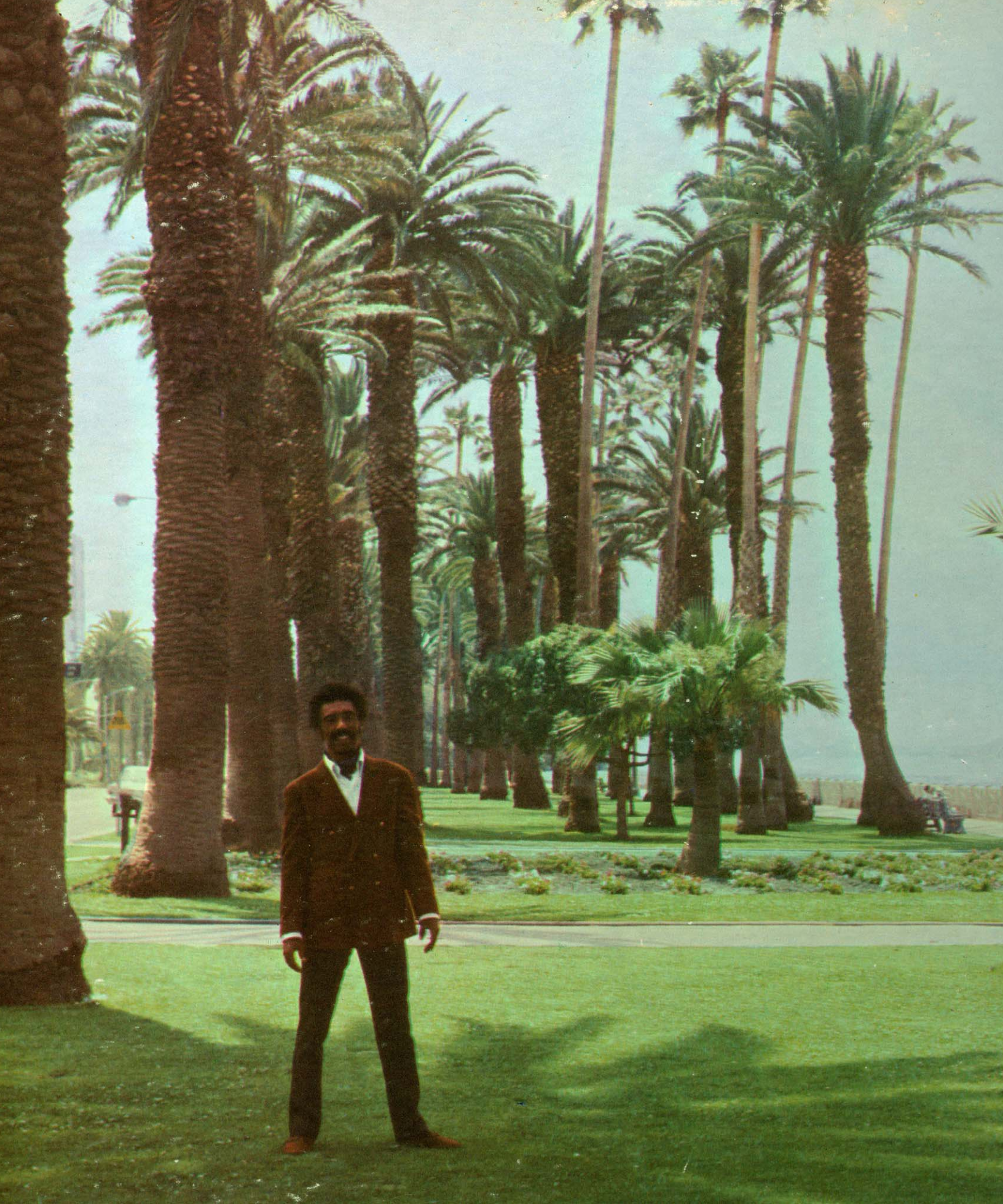
Gerald Wilson, back cover close-up. The Gerald Wilson Orchestra, California Soul (World Pacific Jazz Records, 1968).