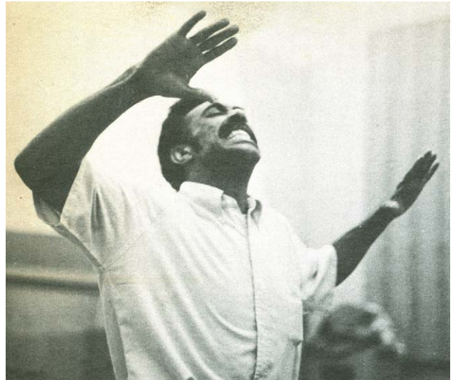
Gerald Wilson, conducting. Liner, Live and Swinging: The Gerald Wilson Orchestra Plays Standards and Blues (Pacific Jazz Records, 1967).

Perhaps this symbolic signification smacks of wishful thinking, but what if Poet and Composer Laureate role models were coupled with a serious (re)commitment to publicly supported K-12 arts education, and to guaranteed funding for the community college, California State University, and University of California systems? The Firestone and Ford