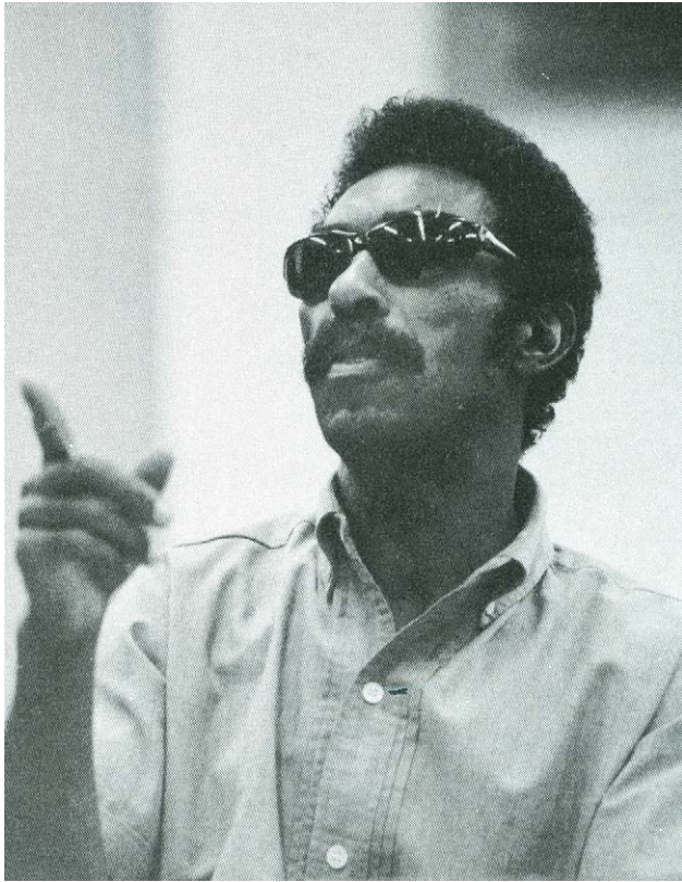
Gerald Wilson, with sunglasses. Inner gatefold cover, Gerald Wilson Orchestra, The Golden Sword: Torero Impressions in Jazz (Pacific Jazz Records, 1966).

practice, professional competition, and passionate performance, pushed and expanded his talents over time, as part of his educational and musical philosophy.