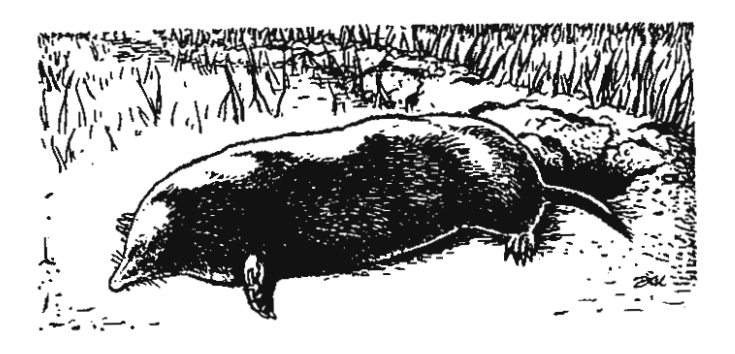
Figure 1. The Broad-footed mole, Scapanus latimanus , the most widely distributed mole in California.

This paper discusses mole control, past and present, with emphasis on the Broad-footed mole, Scapanus latimanus , which is the most widely distributed and common mole pest in California (Figure 1). While there have been some changes through the years in the methods used and their importance in reducing the problems moles cause, the single most useful control method, trapping, has changed very little over the past 100 years. Each of the major management methods or approaches are discussed separately.