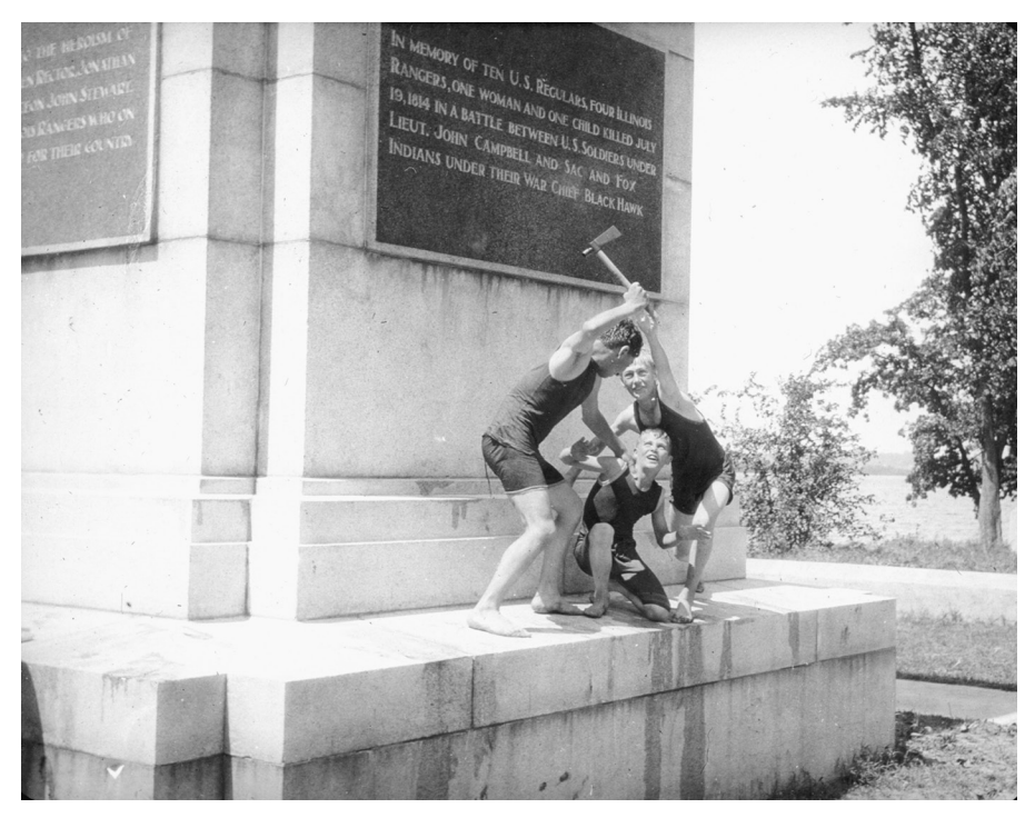
FIGURE 3. On 20 July 1914, three boys who were probably attending Camp Hauberg reenacted frontier violence at a monument commemorating an engagement with Black Hawk during the War of 1812.