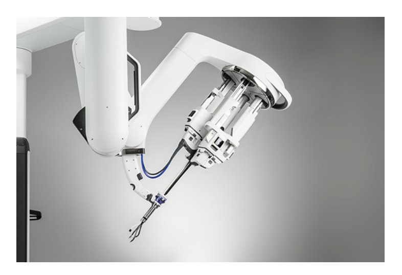
Fig. 1. da Vinci<sup>®</sup> Sp patient-side cart (Intuitive Surgical Inc., Sunnyvale, CA, USA).

In multiarm robotic head and neck surgery of today, only 2 of the 3 available working arms are utilized because there is no additional room to maneuver the third robotic instrument arm. One instrument is used to grasp tissue, providing tension, while the other instrument is used for dissection. The main working instrument is usually a monopolar spatula or bipolar instrument.