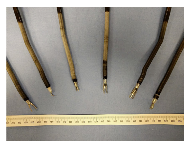
Fig. 4. da Vinci<sup>®</sup> Sp instrumentation. A variety of instruments will be available for the da Vinci<sup>®</sup> Sp system including energy devices (bipolar and monopolar instruments), needle drivers, grasping instruments, and clip appliers.

surgeon at a second robotic console, all 3 instruments can be controlled simultaneously. This third instrument can be continually adjusted to change the vector of pull with the use of the instrument swap pedal. With the addition of one working instrument, TORS procedures may benefit from better surgical plane manipulation through traction and countertraction. Mucosal folds that would otherwise be tented or collapsed in traditional 2-arm TORS can now be retracted and better exposed. Expanded maneuverability in tissue manipulation may result in better hemostasis and margin control rates.