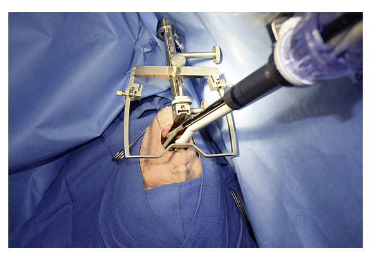
Fig. 2. da Vinci<sup>®</sup> Sp docked for oropharynx approach (Intuitive Surgical Inc., Sunnyvale, CA). Oropharynx retraction with FK-WO retractor (Olympus). Ample space around the patient's face is available for the bedside surgical assistant.