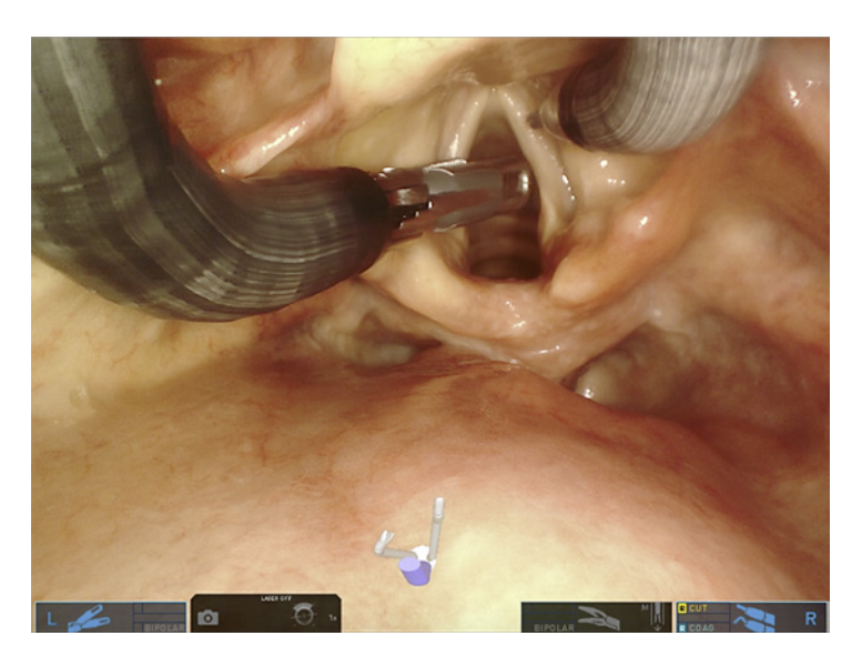
Fig. 5. da Vinci<sup>®</sup> Sp graphical user interface (Intuitive Surgical Inc., Sunnyvale, CA, USA). The 3-dimensional operative image is visible to the surgeon (2-dimensional image here). The schematic in the middle-lower portion of the screen displays the camera and instrument arm configuration.