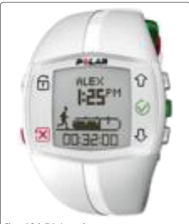
Figure 2 Polar™ Active accelerometer.

The accelerometer protocol was developed to target participants aged 5-7 y. Each eligible child uses the device which is worn on the wrist for seven consecutive days, allowing for the collection of five complete days of data inclusive of at least one weekend day. Children and their parents are verbally instructed to not remove the accelerometer during the period of use, including during water-based activities (e.g., bathing, swimming) and while sleeping. Parents are provided a diary to note any removals, including the time, duration and reason for removal. As part of the protocol development, a qualitative pilot was conducted with children in a rural community similar both culturally and socioeconomically to the target communities in this study, to test device acceptability and protocol adherence.