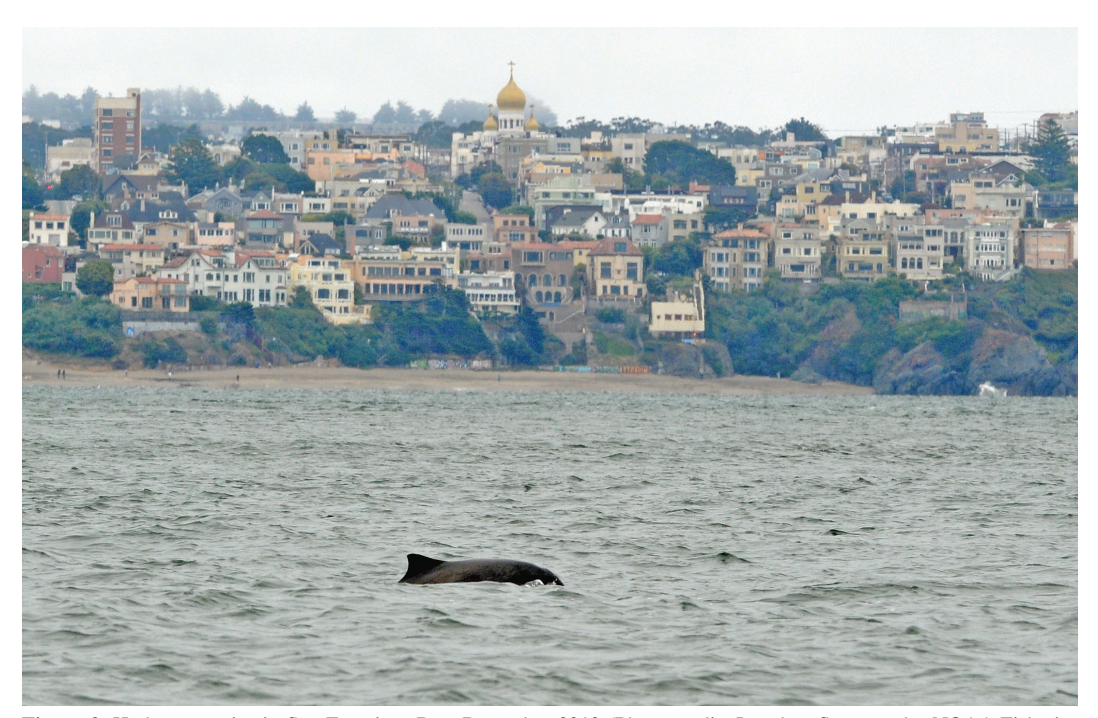
Figure 2. Harbor porpoise in San Francisco Bay, December 2010. The gold domes in the background belong to the Russian Orthodox cathedral.