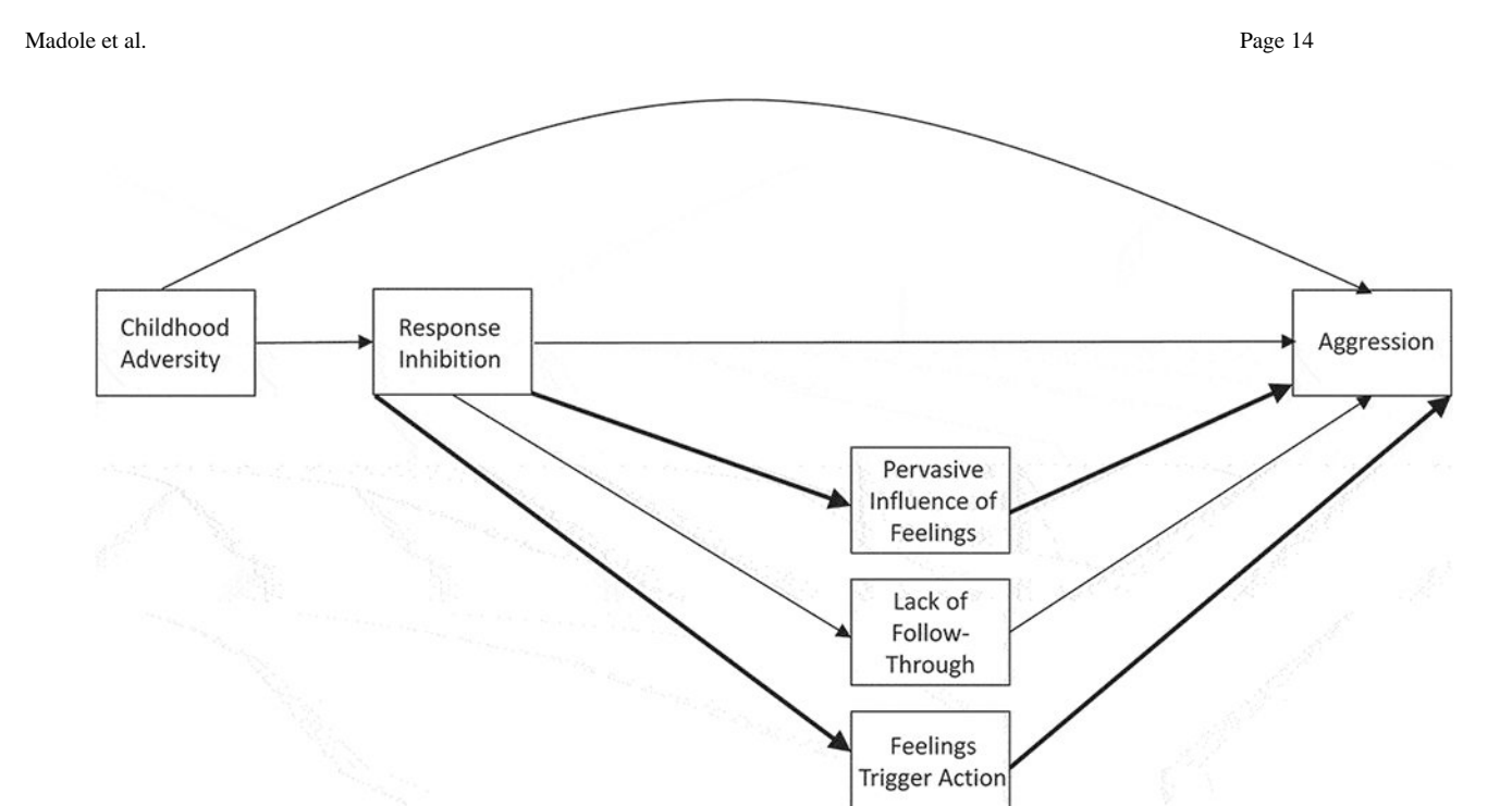
Figure 1. Hypothesized Model of Risk for Aggression, after McLaughlin (2016) Note. Bold lines indicate emotion-relevant pathways.