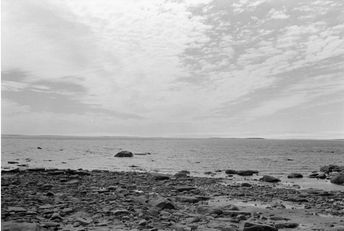
Figure 5. 1973 photograph from a boat trip near the town of Fort George, Québec at the mouth of the La Grande. Fort George was relocated in 1980 due to impacts caused by the James Bay Hydroelectric Project.

Arriving in Adam's Rib, Angel does not know how to swim. This slowly changes, as she responds to her newfound watery world, learning from Bush and from the swimming animals she encounters. Swimming becomes a way for Angel to physically, mentally, and emotionally navigate the changing world she finds herself part of -- and it allows her to submerge herself in the floodwaters covering her homelands. Submersion becomes a method, both metaphorical and physical, for navigating the rising waters caused by the hydroelectric construction. For example, Angel recounts entering a near-Arctic lake: