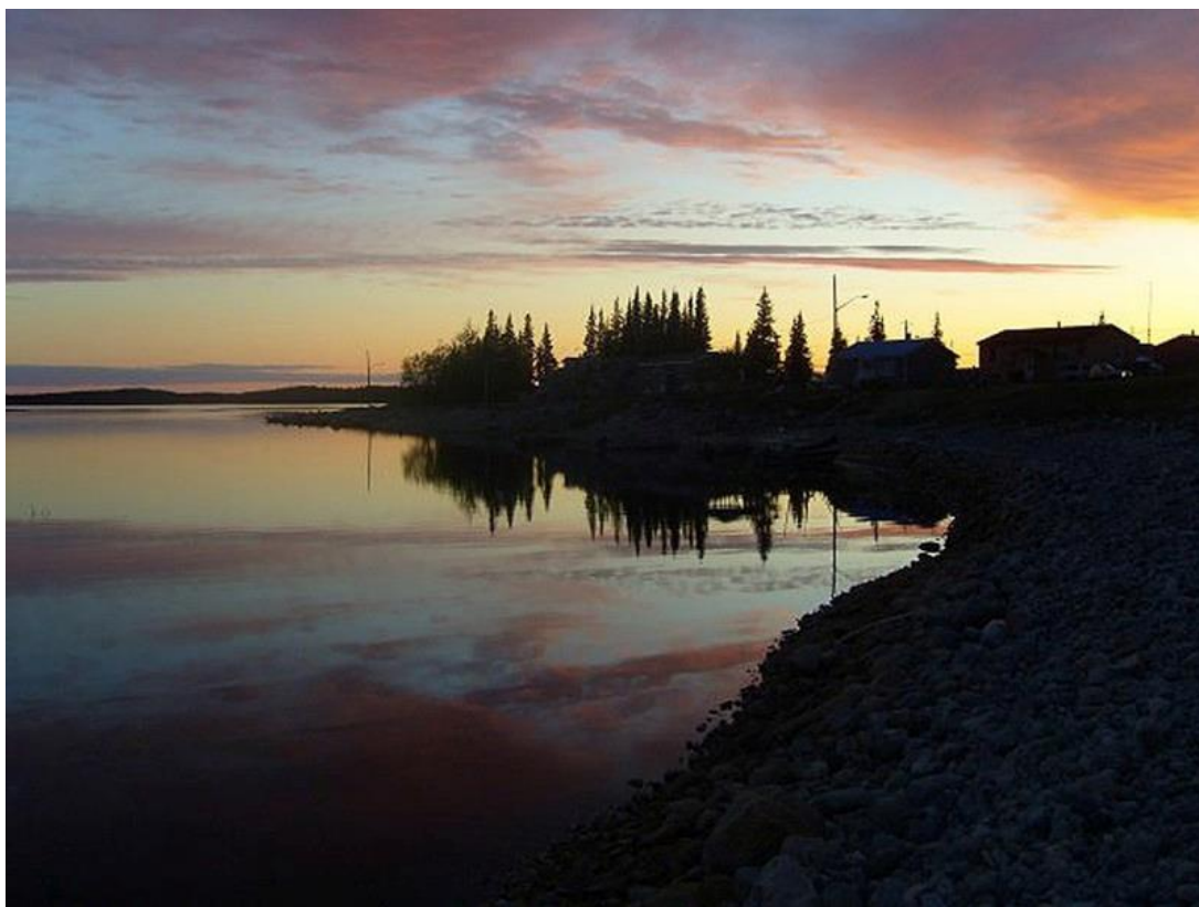
Figure 7. Historic photograph of Wemindji, Québec. Water at sunset. Photograph by Beverly Mayappo. Part of the James Bay Ethnographic Resource Digital Archives.

afraid, it was a full feeling. We thought maybe this was our time. We believed in what we were doing, and like the others, I felt hope that we would succeed, that we would be able to protect the earth and her people. On those nights the evening light turned rosy and a cloud or two rose up from water. 108