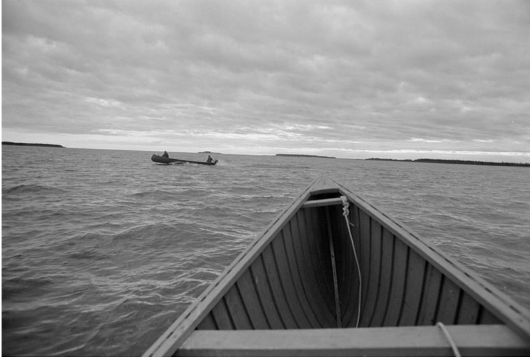
Figure 3. Photograph taken in Eastmaine, Québec in the summer of 1973, shot from inside of a canoe, looking at the prow, with another canoe in the background.

Angel understands the power grid to be an infrastructure of control and colonial hydropower projects, like the ones constructed at James Bay, as a reduction of water's possibilities – objectifying and commodifying water as a resource to be extracted in order to harvest its power. When listening to a radio while doing chores shortly after electrification from the new hydroelectric construction reaches her family's home, Angel muses to herself,