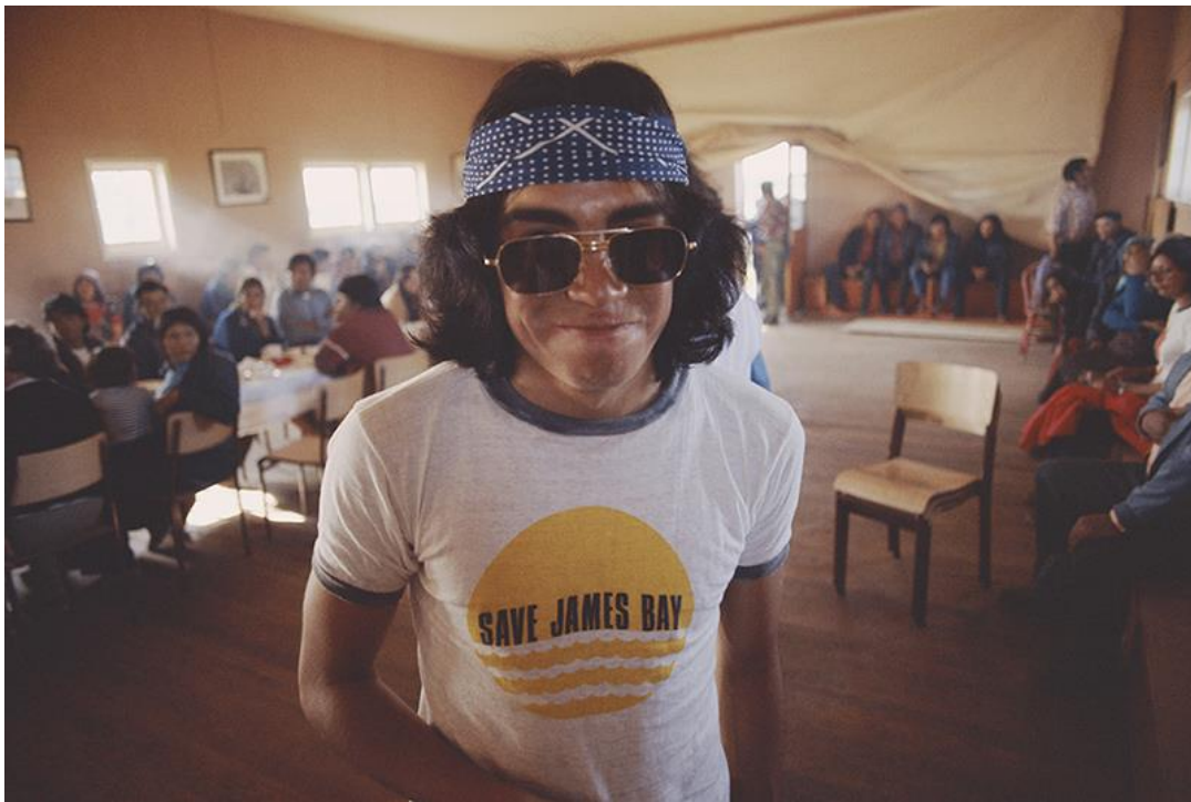
Figure 1. 1973 photograph.

Furthermore, the reservoirs created methylmercury contamination when mercury was released from the rotting vegetation in them. 30 The mercury contamination moved up the foodchain and entered the region's fisheries, which were, and are, central to traditional Cree foodways. The impacts of the James Bay Hydroelectric Project exemplify how the environment is a site where colonial violence is enacted; the different scales and temporalities of this environmental violence; and, the ways these spectacular instances of colonial environmental engineering extend into the future.