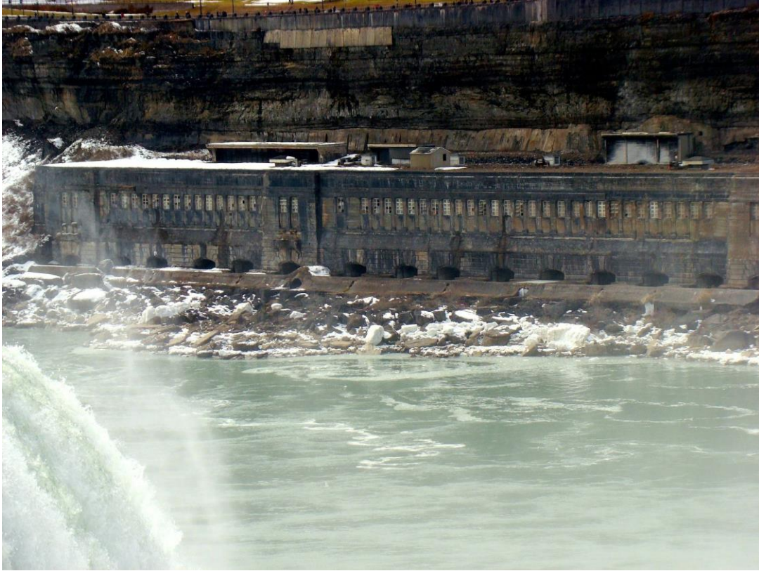
Figure 2. Ontario Power Company Generating Station at Niagara Falls. The station was decommissioned in 1999, and is now a Canadian Cultural Heritage Site. Photo licensed under the creative commons.

Goeman, in “Electric Lights, Tourist Sights: Gendering Dispossession and Colonial Infrastructure at the Niagara Falls Border,” writes that “for the United States and Canada, the Niagara Falls site ideologically marks the recognition of co-constitutive settler powers, where might over right wins out in the extraction of resources.” 44 The damming and diversion of the Niagara River resulted in the first treaty dealing with the distribution of hydroelectric power