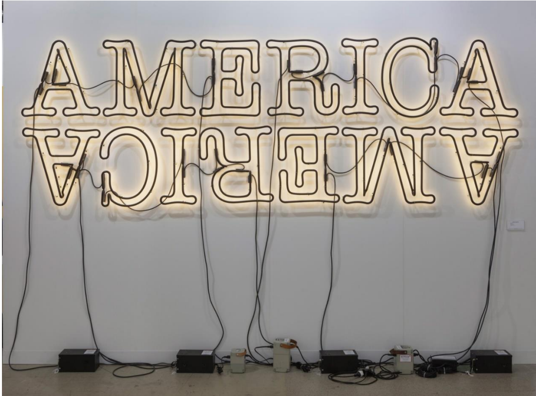
Figure 2. Double America 2 by Glenn Ligon, part of his series of “Neons.” The photograph is part of The Broad’s Collection .

consciousness” in the US. In other words, a formative part of US electric consciousness renders electricity equivalent to the figure of the slave. In The Leaky Grid 's commitment to unsettling the colonial man as human, it prioritizes electrified Black and Native cultural production in order to ensure that Black and Native electrified cultural production is central to imagining energy, environments, modernity, and the future otherwise.