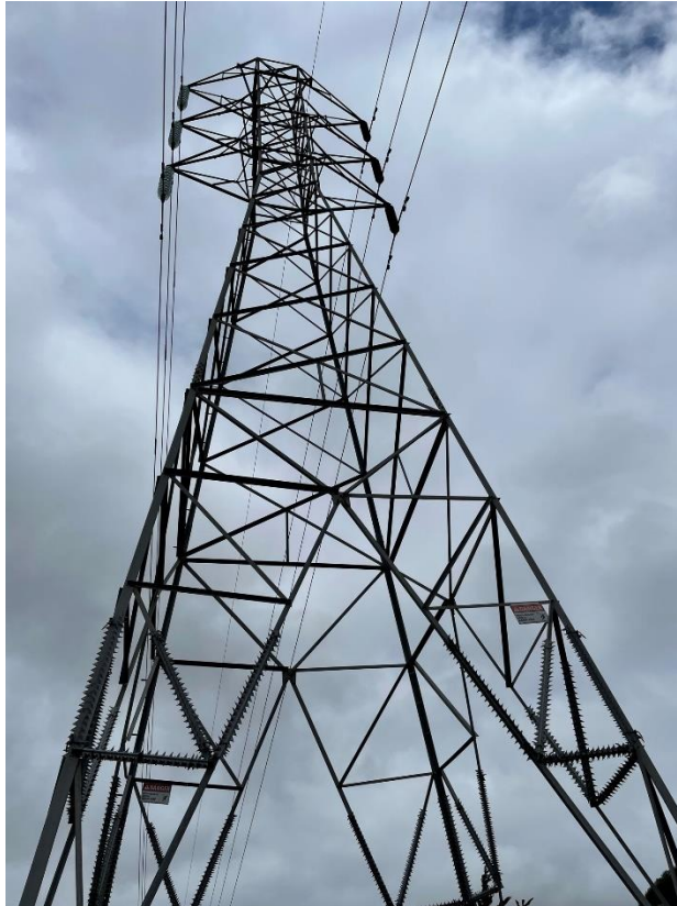
Figure 2. An electricity tower in PG&E’s service territory, just outside San Luis Obispo, California. The photo shows the impossibility of visualizing electrical infrastructure within a single frame. The tower looms, too large to fit in the photograph, and the transmission lines exceed capture by the photo’s frame, alluding to the larger interconnected grid system the

is not true.” 40 To account for the representative, imaginative, and material, I adapt a close reading approach commonly used in literary studies to scrutinize specific infrastructural segments, details, interrelations, and attributes in order to produce meaning about the system—much the same way literary scholars who practice text-based close reading focus on specific details in order to produce knowledge about a text.