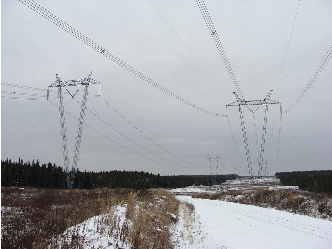
Figure 4. These Hydro-Québec V-guyed towers and power lines carry electricity generated from the James Bay Hydroelectric Project to load centers in southern Québec, 1,000 km away.

Angel's above reflection – on electricity and the developers' "desire to guide the waters, narrow them down into the thin black electrical wires that traversed the world. They wanted to control water, the rise and fall of it, the direction of its ancient life. They wanted its power" 66 – ends with an acknowledgement of the multiple meanings of power – collapsing the different meanings of power, including its reference to energetic work and its relationship to sociocultural power and authority. Goeman has also noted the multiple ways the word power