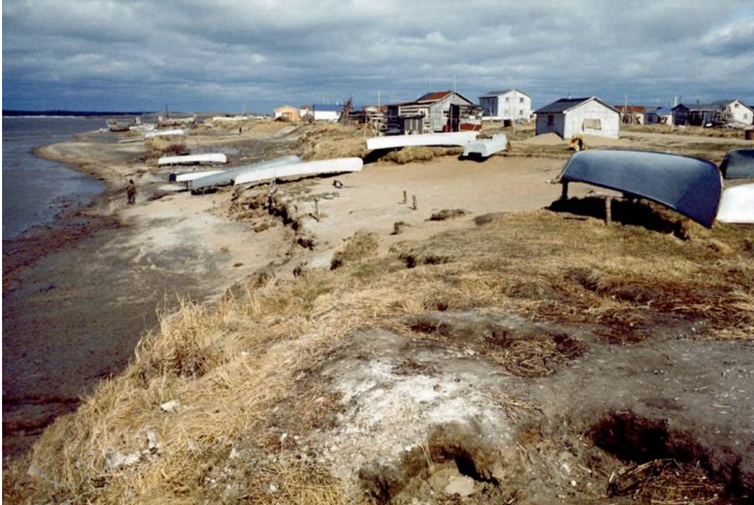
Figure 6. Color photo from George Legrady’s visit to Fort George Town, titled “Canoes docked on the beach in front of houses in the distance. This is a historical photograph taken during Legrady’s photography trip in the 1970s. Fort George Town was located on Fort George island in the mouth of the La Grande. Due to dam construction (as part of the James Bay Hydroelectric Project), the La Grande’s flow and ice cover changed. In 1980, the town voted to relocate from the island to the riverbank.

The landscape and town of Fort George, depicted in George Legrady’s photographs no longer exist as such. Located in the mouth of the La Grande Riviere, the town was relocated after the James Bay hydroelectric development on the river, which caused the river’s currents to become unpredictable and the banks of the town’s island home to dangerously erode. The