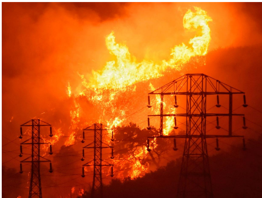
Figure 1. The Thomas Fire as it burns through Montecito, CA on December 17, 2017. It will take Firefighters more than a month to 100% contain the fire.

– Deborah A. Miranda (Esselen and Chumash), Bad Indians: A Tribal Memoir (2013)