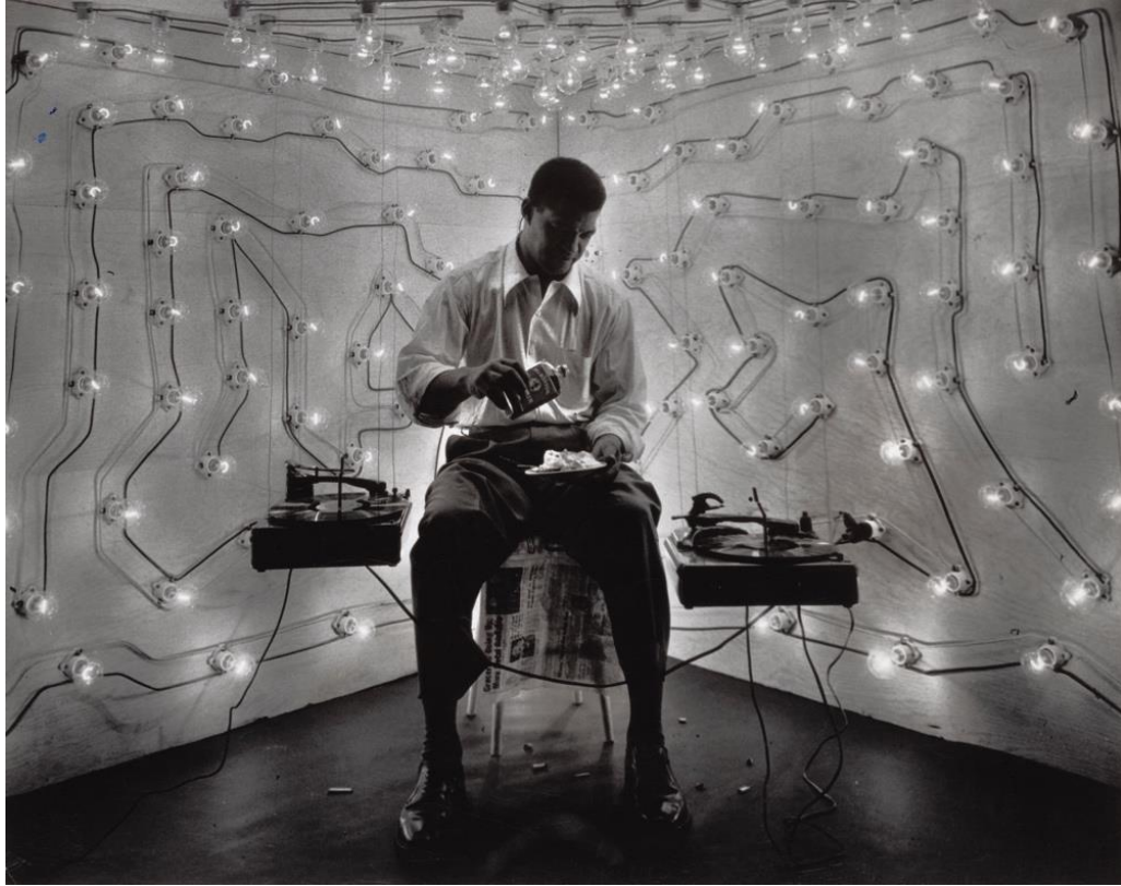
Figure 1 and 2. Gordon Parks. "Invisible Man Retreat" and Untitled from Parks 1952 collaboration with Ellison based on Invisible Man. Harlem, New York, 1952.