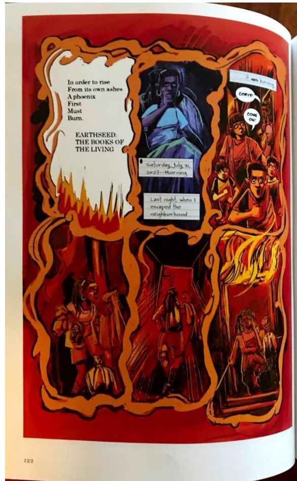
Figure 4. “In order to rise / From its own ashes / A phoenix / First / Must / Burn. / EARTHSEED: THE BOOK OF THE LIVING ,” from page 122 of Parable of the Sower , adapted and illustrated by Damian Duffy and John Jennings.

to have rejuvenation.” 68 Butler’s complex fiery future centers an acknowledgement of fire’s capacity for destruction, but also the way it ignites change and sparks renewal.