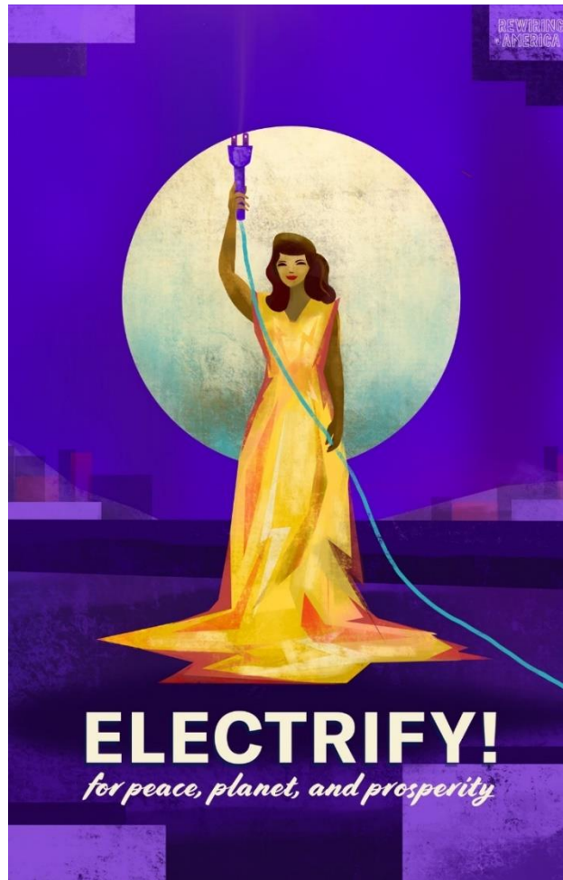
Figure 1. Electrify! for peace, planet, and prosperity. Rewiring America. 2022.

The above image (Figure 1), was shared on Twitter by Rewiring America, “the leading electrification nonprofit,” 23 alongside their joint letter. The image clearly evokes the Statue of Liberty – an iconic visual metonym for the US colonial nation state. However, instead of Lady Liberty’s right arm raising a torch toward the sky to light the way for the “huddled masses” as they migrate to the shores of the so-called “New World,” Rewiring America’s lady liberty holds an electrical plug. Drawing on (colonial) textbook narratives of the US as a melting pot,