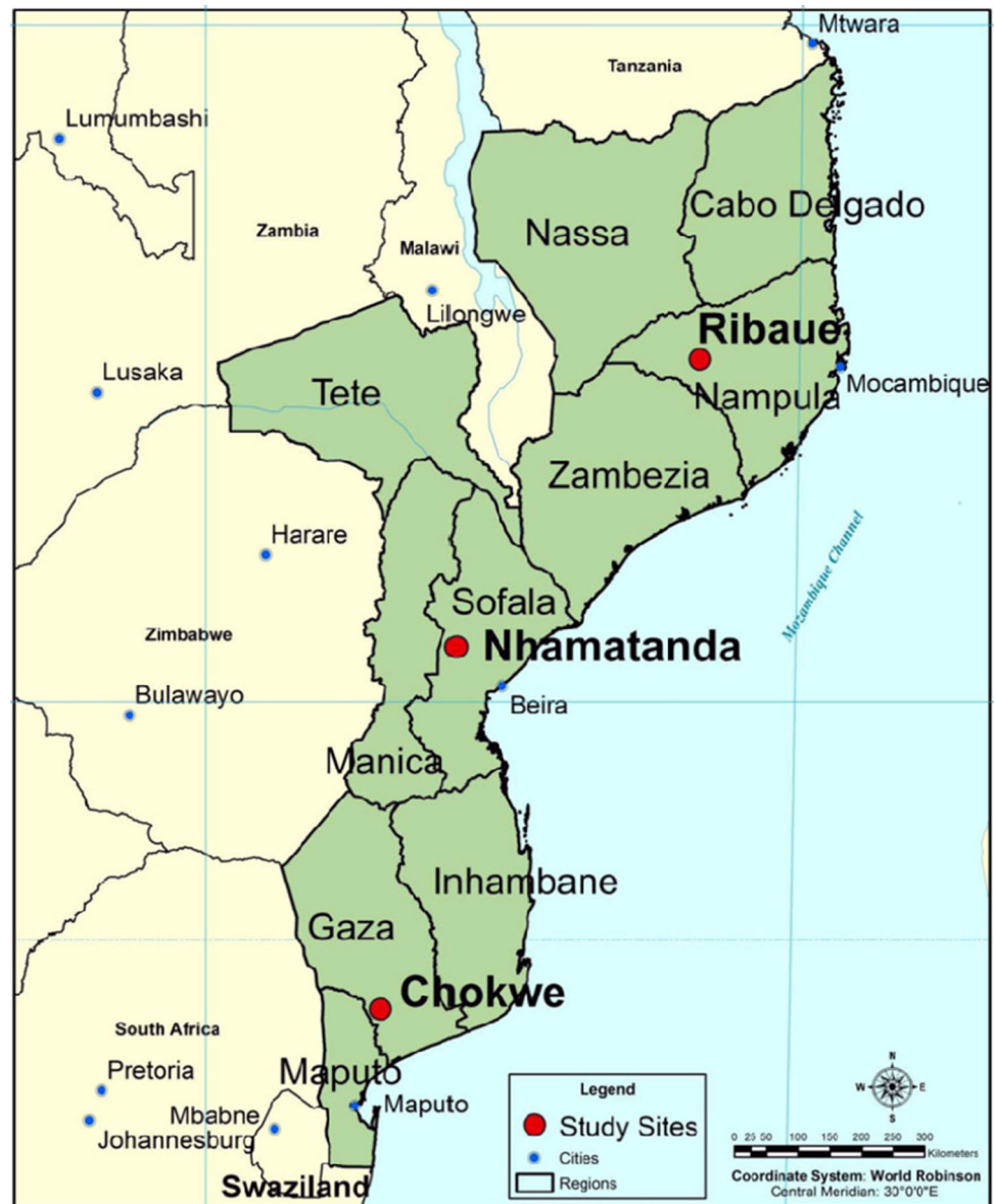
Fig. 1 Map of three rural study sites in Mozambique adapted from Anderson et al. [21]