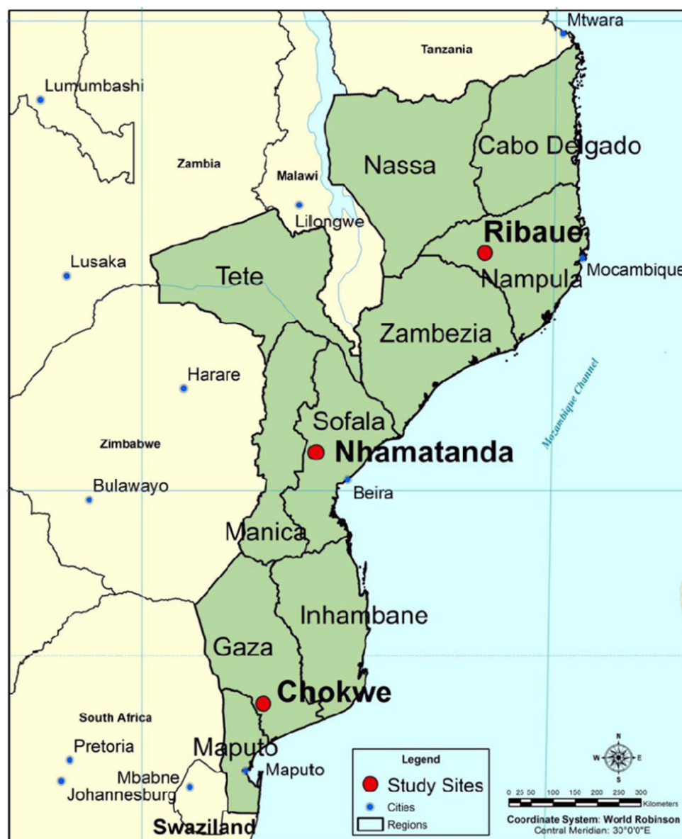
Fig. 1 Map of three rural study sites in Mozambique adapted from Anderson et al. [21]