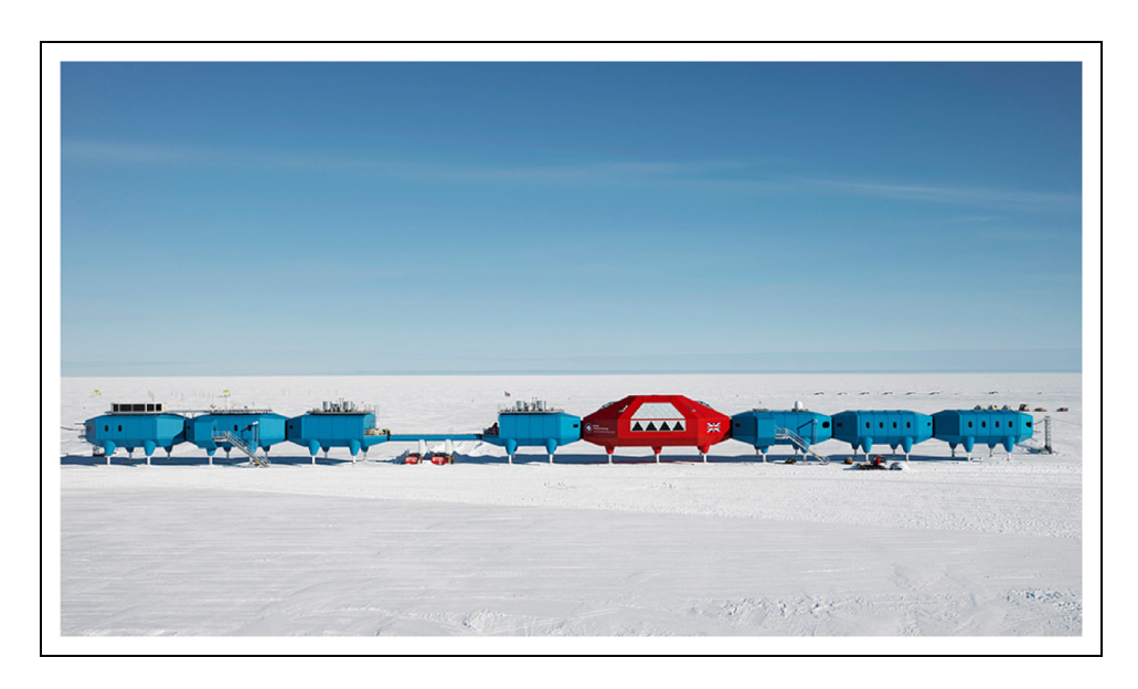
Figure 1. Full view of Halley VI from the outside, Source: Hugh Broughton Architects (Hugh Broughton Architects, 2022).