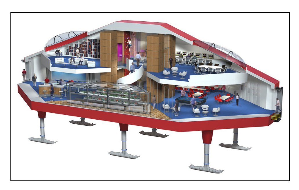
Figure 3. Early computer-generated model of the central module as initially designed.

central design features. At the same time, Halley VI's inherence of tertiary memory sits within the context of globalized commodity circulation, sweeping together these instances of exteriorized memory with dramatically decontextualized elements of sense, discourse, and material, fitting for a base positioned as central to logistically coordinating observation and representation of global climate. For the imagined subjects within, decontextualized sense experience and objects fill in a sensory landscape otherwise recognized as uniquely barren.