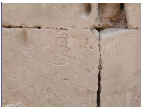
Figure 3. "Emulation" of Khonsu bark figure. West exterior wall of Khonsu Temple, Karnak.

of such boxes has not been studied in depth, but their presence may prove useful for dating and placement purposes and may also provide a means of connecting textual graffiti with figural forms. We also find numerous signs of religious significance, such as pilgrims' feet in and around pilgrimage destination sites (mainly tombs and temples), and religious images on the exterior walls of temples (such as the Khonsu Temple at Karnak), where the general populace honored the local temple gods (fig. 2).