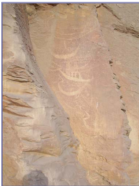
Figure 1. Scene of Abdel Qurna boat graffiti.

of such boxes has not been studied in depth, but their presence may prove useful for dating and placement purposes and may also provide a means of connecting textual graffiti with figural forms. We also find numerous signs of religious significance, such as pilgrims' feet in and around pilgrimage destination sites (mainly tombs and temples), and religious images on the exterior walls of temples (such as the Khonsu Temple at Karnak), where the general populace honored the local temple gods (fig. 2).