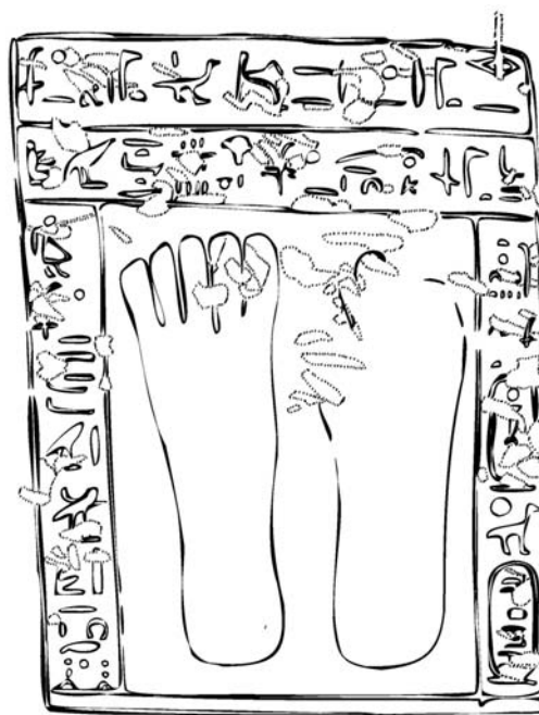
Figure 2. Foot graffiti with text and box around it.

The range of figures bearing figural graffiti is immense and often exhibits some connection to the location in which the figures were found. Thus sites that had religious significance, such as temples and shrines, may feature a large number of representations of deities—either anthropomorphic images or examples of animals sacred to the local deity (rams, vultures, falcons, bulls, and the like are all seen in various contexts). One complicating aspect of the role of figural graffiti in temple areas is the question of whether the exterior walls, where most of these graffiti are found, bore official decoration (scenes and/or hieroglyphic inscriptions), for we find examples where people emulated already existing decorations by replicating, for example—and usually on a smaller scale—a deity (standing or seated on a throne), an offering table, a sacred bark (fig. 3), or a flower bouquet. In many cases the quantity and size of the graffiti were contingent on the amount of relatively flat space available. In quarries and in way-stops on caravan routes, figural graffiti depicting the “composer” are common (fig. 4), as are depictions of desert animals, cattle, donkeys, and camels.