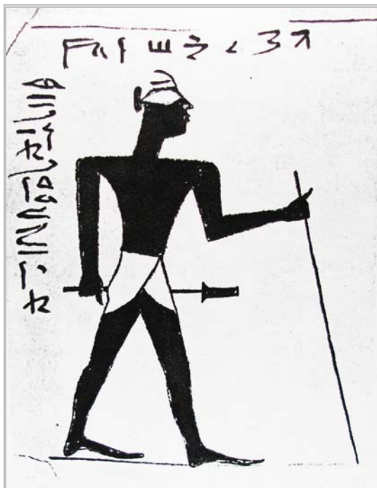
Figure 4. "Composer" graffito from Hatnub.

Over time some sites became contested areas, competed over by several parties. A classic example of this is the Temple of Isis on the island of Philae (Cruz-Urbe 2002; Frankfurter 1998), where Egyptians, Nubians, Greeks, Romans, and later Coptic Christians, each claimed access and rights to all or part of the island. Each group had its own priority and wrote its own culturally designated graffiti there (mostly textual, although some figural examples are present). A similar situation can be found in the royal tombs in the Valley of the Kings: on the tomb walls we frequently find examples of textual graffiti left by Greek, and Greek-speaking Egyptian, visitors, as well as some figural graffiti. Later the Coptic Christians usurped these spaces, converting the tombs into sites dedicated to local martyrs (for example, the martyr Appa Ammonias in the tomb of Ramses IV) by drawing abundant crosses and figures of the local saint (fig. 5).