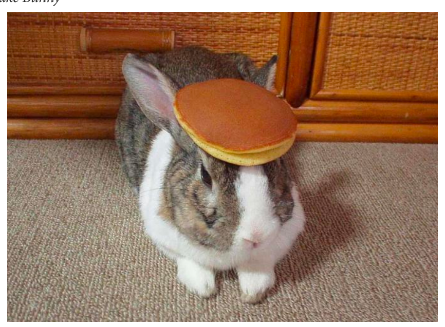
Figure 1 Pancake Bunny

Over the next two years, I was plagued with a vague but undeniable sense that we were doing students a disservice by not giving them more information about our courses and all the pathways they might take through (or around) Foundations Writing. I was also increasingly frustrated by our lack of control over the placement website, where student information had to be uploaded manually from our SMS on a near-daily basis as we approached summer orientations, and where, if a student reported information that hadn't been uploaded, they were met with a 404 error accompanied by an image of a bunny with a pancake on its head ("Pancake Bunny").