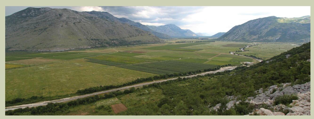
Popovo polje in Bosnia-Herzegovina is around 40km long and up to 5km wide. The Trebinjcica River, now canalized, flows along its floor. Under natural conditions there were over 500 sinks (ponors) and reversing springs (estavelle).