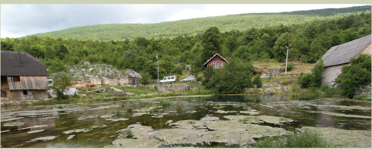
Majerovo Vrilo, Croatia: A large vauclusian spring explored by cave divers to a depth of 92m below the point of emergence.