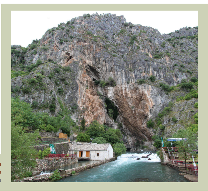
Buna Spring (Bosnia and Herzegovina) is one of the largest springs in Europe, with an annual average flow of about 43m<sup>3</sup>/s. It emerges at the head of a pocket valley.

caves, form where carbonate rocks crop out at the