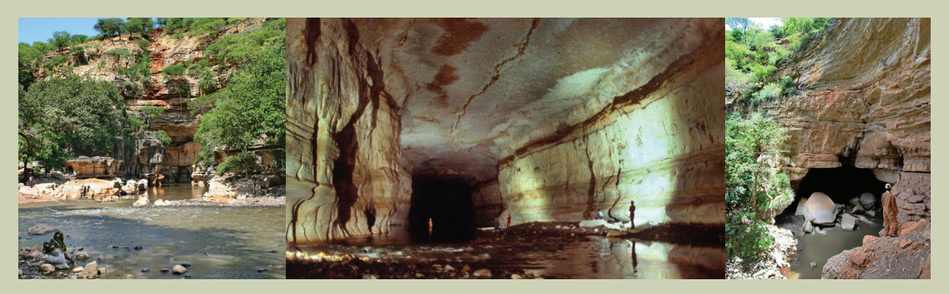
An example of a through cave in Ethiopia. Here, the Weib River sinks at the entrance to Sof Omar Cave (left) and can be followed through large passage (center) to the spring where it emerges (right).

are commonly extracted underground. Surface mines destroy karst landforms, but may also expose features of geoheritage value. Both surface and underground mines commonly intersect cave passages. The resolution calls on IUCN member states to conserve those mining environments that have high natural heritage value (both geological and biological).