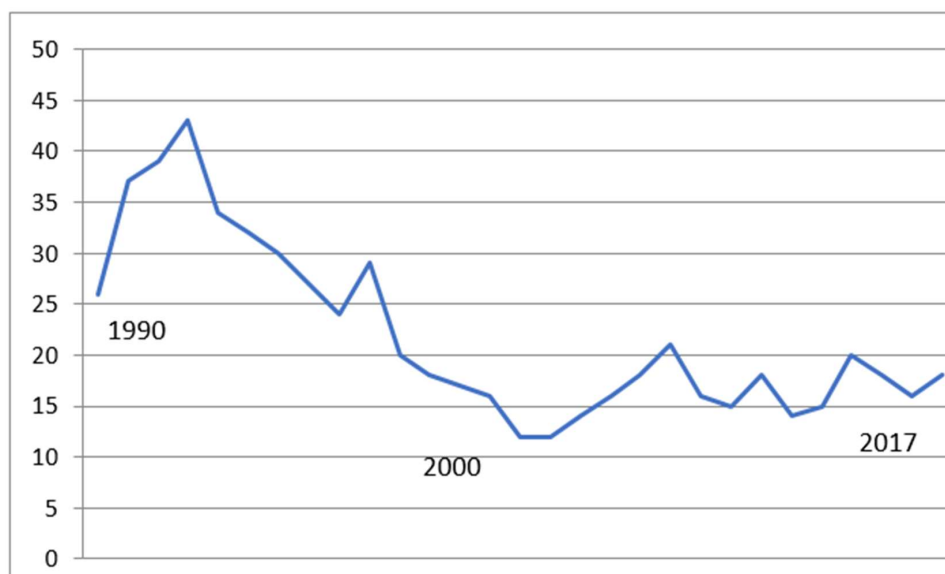
Figure 2. Post GEM transfer length of stay (LOS) (days). Mean LOS (1987–2000) 29.9 (SD 4.8) days, (2001–2017) 16.2 (SD 1.3) days, F = 49 , p < 0.0001 .