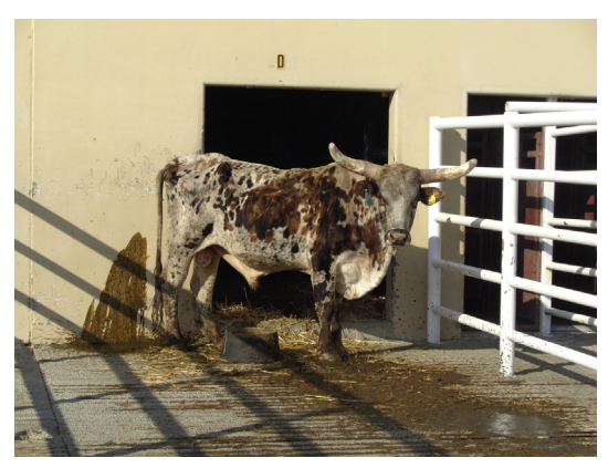
Fig. 1. A 5-year-old mixed breed bull showing clinical signs of paratuberculosis, including thin body condition and profuse diarrhea.