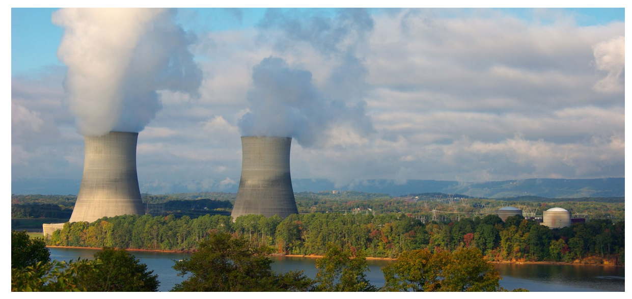
Sequoyah nuclear power plant near Chattanooga, Tennessee.