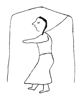
FIGURE 5. Winkte suicide, British Museum Winter Count.