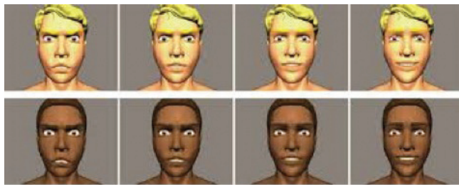
FIGURE 1. SAMPLE FACIAL EXPRESSION TEST

This behavior ranges from perceiving facial expressions differently to offering job callbacks at different rates to seeing guns more quickly in relation to some racial groups relative to others. Specifically, in studies of facial expressions, whites with stronger implicit racial bias perceive black faces as angrier than whites with weaker levels of bias; similarly, those with stronger implicit bias are apt to consider an expression happy or neutral if displayed by a white person, but neutral or angry if displayed by a black person (Hugenberg & Bodenhausen, 2003).