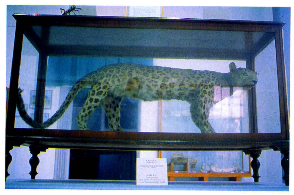
Fig. 4 - The stuffed specimen of Asia Minor leopard, Panthera pardus tulliana Valeciennes, 1856, on display at the Natural History Museum of the Aegean (Samos, Greece).

However, de Tournefort's account was probably not based on an eye-witness observation, but was rather inspired by the oral testimony of the local people. This explains the confusion between tigers and leopards, which was probably due to an incorrect translation of the term kaplani . In any case, since the distance of the island from the mainland is no more than 1.7 km, it cannot be excluded that leopards could have reached the island by swimming, at various times. These felids are good swimmers and could have come from the Samsundag range which, as already observed, up until the early 1970s was reputed to be the last Western Anatolian stronghold of the species (cf. Kumerloeve, 1971; Ulrich and Riffel, 1993)