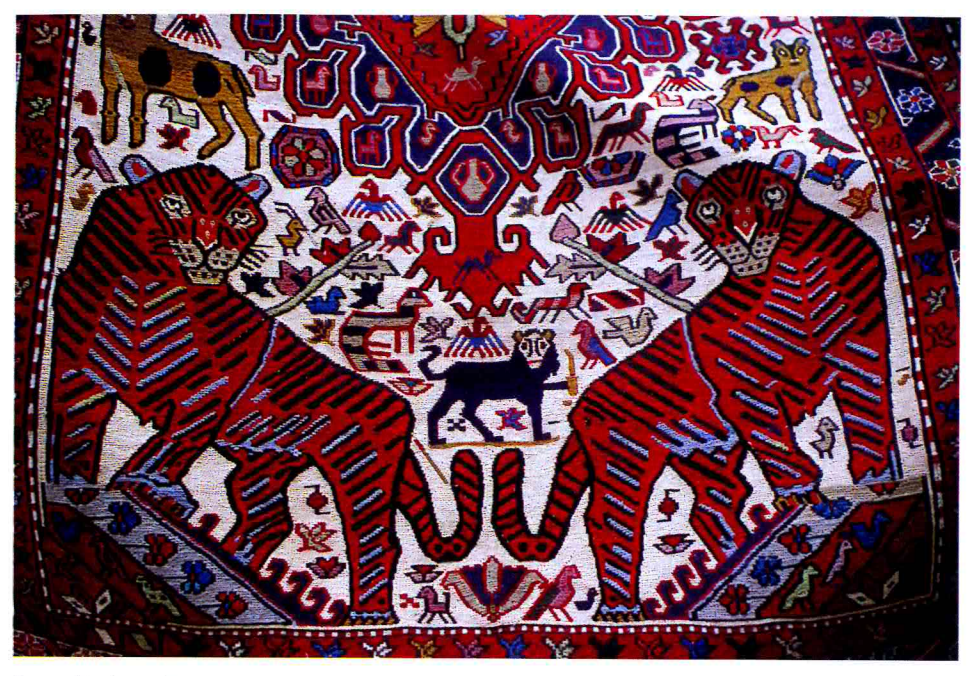
Fig. 1 - Traditional Eastern Anatolian kilim showing, among other animals, the images of tigers and lions.

(Schreber, 1776), Lynx. Lynx (L., 1758), and possibly Panthera pardus (L., 1758), is still reported from several Anatolian areas, although human persecution had largely confined them to isolated areas. The present paper deals with the recent historical diffusion of these species in Anatolia. It is based on a review of previous knowledge of the Turkish wild cats and their history, on contacts with the Forest Department of Antalya, the Samsundag National Park (Izmir), and the Termessos National Park (Antalya), as well as on original data. Museum specimens were examined in the Natural History Museum, London (BMNH), the Termessos National Park Museum, Antalya (TNPM), the Natural History Museum of the Aegean, Samos (NHMA), the Zoological Museum of Tel Aviv University (ZMTU), and some Near-Eastern private collections.