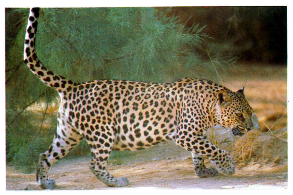
Fig. 3 - Adult female of Arabian leopard, Panthera pardus nimr Hemprich and Ehrenberg, 1833.