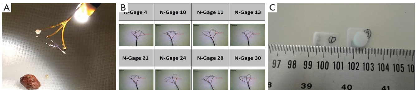
Figure 2 Durability, versatility and efficacy testing. (A) The basket was passed through a simulated endoscopic working channel and cycled in grasping and releasing synthetic stones; (B) red arrows depict areas of visible basket breakdown in baskets inspected after repetitive use; (C) stone model showing 1 and 9 mm synthetic model stones.

closes at full deflection of an ureteroscope ( Figure 1B ). This basket is designed to grasp stones as small as 1 mm. The OpenSure™ Handle confers a safety mechanism for entrapped stones that cannot be released by traditional opening of the basket—specifically, it enlarges by 50% and 39% in diameter for 8 or 11 mm baskets, respectively ( Figure 1C,D ). This enlargement potentially allows the release of entrapped stones.