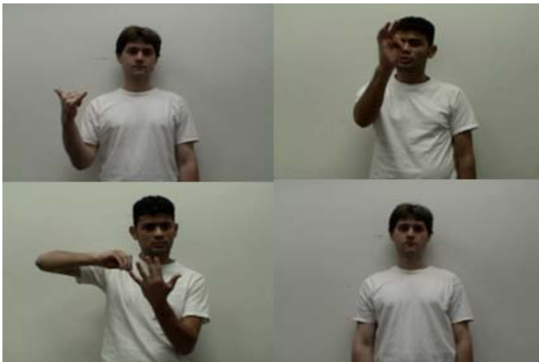
Figure 1. Examples of experimental stimuli. A) Euro-American actor performs the classic American 'hang loose' gesture. B) Nicaraguan actor performs a typical Nicaraguan gesture 'I swear (promise)' and C) one of the control gestures modified from the ASL sign for 'berries'. D) Euro-American actor in the 'static' condition.

Based on the above evidence of the influence of the observer's own motor repertoire on action perception, we hypothesized that a shared motor repertoire leads to more effective communication. Thus, we predicted that our Euro-American participants would