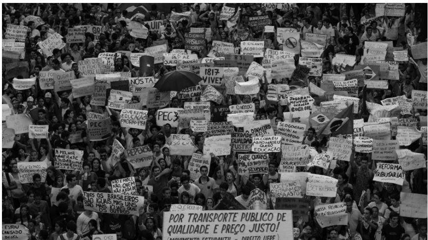
Figure 2: Mass protest. Recife, June 2013.

Many posters advanced moral positions. Some appealed to principles such as “for a life without turnstiles; ideas are more lethal than guns; don’t accept what bothers you.” Others used comparison to argue about acceptable standards of urban life. The June 2013 protests occurred during the FIFA Confederations Cup, an international soccer competition and run-up to the World Cup which Brazil hosted during the summer of 2014. Given that Brazil is obsessed with soccer and that its national team played brilliantly and won the Confederations Cup, it was truly extraordinary that the protests not only shifted attention away from the matches but also used the games to make points of negative comparison, seething with