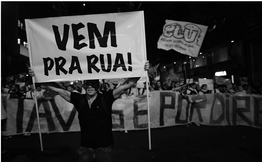
Figure 1: “Come to the street!” São Paulo, June 17, 2013.

look at the street itself as the domain of urban insurgency. As in Occupy and Indignado movements elsewhere, the Brazilian protesters voiced their grievances under a tide of posters, overwhelmingly handwritten and individually carried, rather than collective banners or flags of political parties (the latter often aggressively repressed by the protestors themselves). The initial spark was a 20-cent fare increase (approximately $0.10 USD) for public buses in a number of cities. The Movimento Passe Livre (the Free Fare Movement, MPL) called for a protest march in São Paulo on June 6, 2013. Founded in 2003 to challenge a fare increase in Salvador, Bahia, MPL has ever since demanded that public transportation be considered a fundamental constitutional right, campaigned for massive investments, and developed economic models to justify its battle cry— “tarifa zero” or “zero fare”—as a radical measure to address Brazil’s public transportation nightmare.