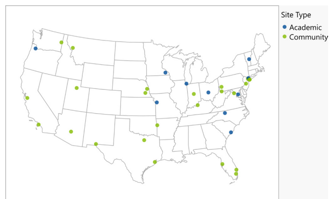
Figure 1 TARGET-DERM has active community (24) and academic (10) sites across the USA.

Adult and paediatric patients of all ages will be enrolled from up to 100 practices, including both academic practices affiliated with a university health system and community-based or private practice clinical centres. The first patient was enrolled on 25 January 2019 and, as of March 2020, there are 34 active sites and an additional 10 in the start-up phase (figure 1). Site recruitment is ongoing. Enrolment rates by site type, geography, patient