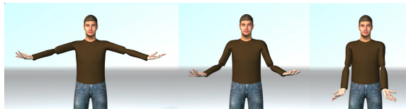
Fig. 6. Virtual agent with different gesture expanse and height for the same gesture.

Thus every story has two versions. One version ends with the female agent’s response, another ends with the male agent’s response. For example, Garden ABA has three turns, ending with the female agent adapting to the male, and