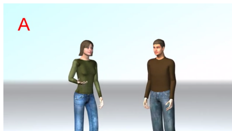
Fig. 4. A snapshot of the experimental stimuli.

Stimulus Construction We currently have 50 annotated story dialogs. In this experiment, we use four stories with different subject matter: protest, pet, storm and gardening, as illustrated in Fig. 1 and Fig. 5. Fig. 4 shows a screenshot of the stimuli. We use our own animation software to generate the stimuli based on the specified gesture script. This software uses motion captured data for the wrist path, hand shape and hand orientation for each gesture stroke, motion captured data for body movement, and spline based interpolation for preparation and retractions. It also uses simplified physical simulation to add nuance to the motion. A gesture contains up to 4 phases: prep, stroke, hold and retract: we insert a hold and connecting prep between two strokes if they are less than 2.5 seconds away from each other. Otherwise, we insert a retraction.