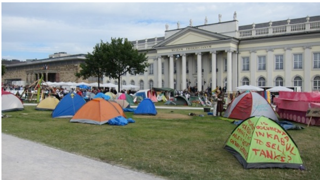
Figure 7: Tents of the Occupy Movement in front of the Fridericianum in Summer 2012, Photo: Doris Koch.

Instead, what caught my eye were the white umbrellas advertising the beer Raderberger Pils in front of the local restaurant that obviously had been granted permission to serve visitors right in front of the Fridericianum (figure 6), only meters away from the tents of members of the occupy movement, which the director also gladly tolerated, as I remembered reading online or in a newspaper (see Geoffroy). A ‘sacred’ documenta site carelessly treated?