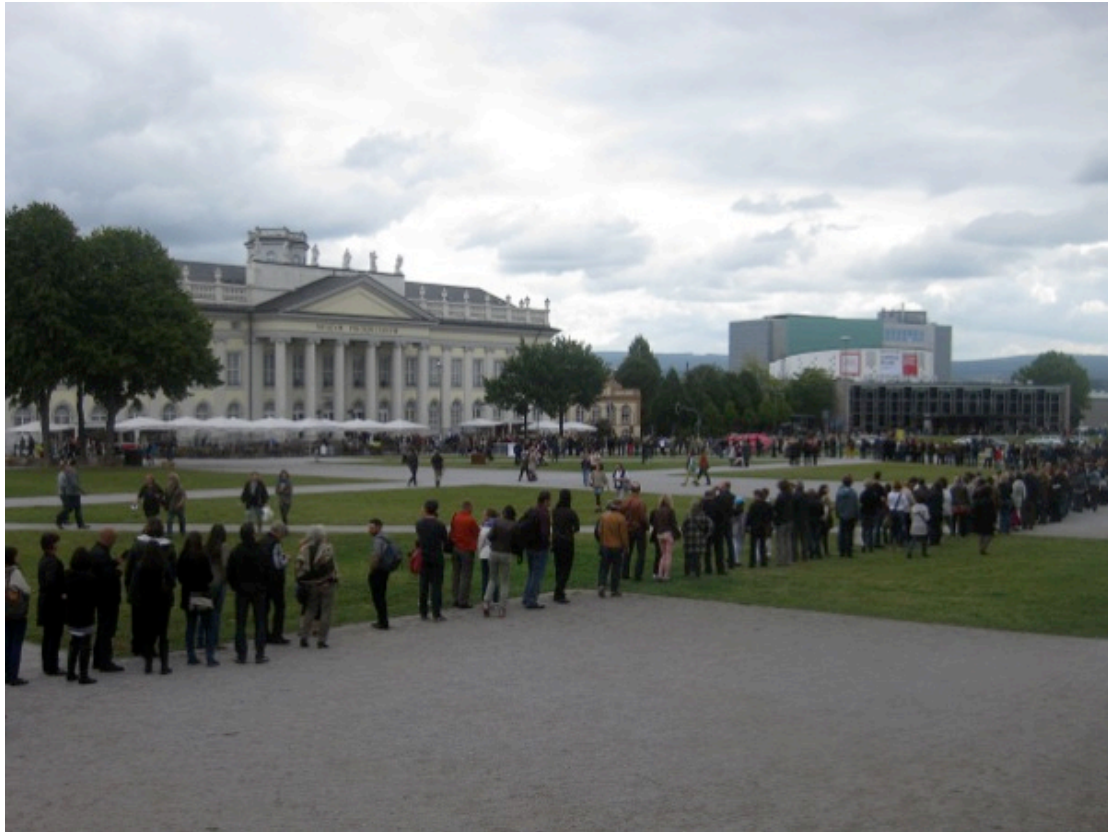
Figure 1: Waiting in line to see dOCUMENTA (13) , Photo: Christos-Nikolas Vittoratos.

When dOCUMENTA (13) closed on September 16, 2012, the German evening news show Tagesthemen reported that the exhibition had attracted around 860,000 visitors, a record for this Kassel-based quinquennial series. Among the visitors were 12,500 journalists whose reviews of the exhibition spurred even more visits both on-site and online. dOCUMENTA (13) also had a record number of first-time attendees, with almost one-third of the total visitors being under the age of thirty, another all-time high. The exhibition could also boast of 188 participating artists and art collectives, and—in addition to venues in Kabul and Bamiyan, in Alexandria and Cairo, and at The Banff Center in Alberta, Canada—of 36 sites in Kassel.