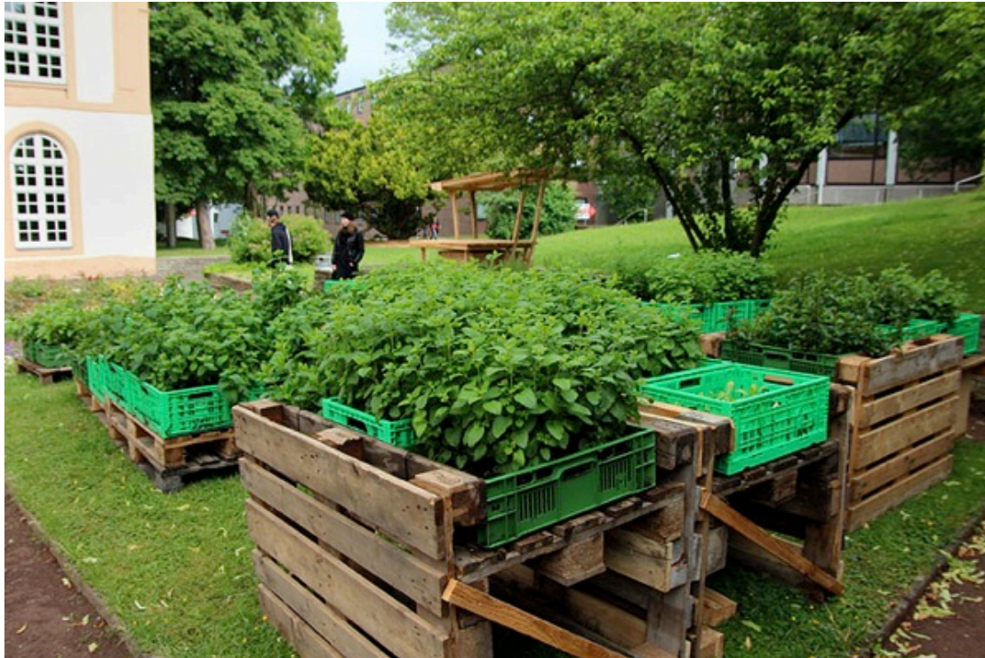
Figure 9: Artist Collective AND...AND...AND...’s The Tea Garden in front of the Ottoneum, Photo: Haupt & Binder. Source: http://universes-in-universe.org/eng/bien/documenta/2012/photo_tour/ottoneum/02/ .

Before we enter the Fridericianum, I would like to take you around providing several more examples of the laconic casualness characteristic of this documenta's curatorial practices. In front of the Ottoneum, neighboring the Fridericianum and the Documenta Hall, visitors could see wooden pallets and plastic boxes. This Tea Garden was part of the project "Commoning in Kassel," an initiative of students at Kassel University's Landscaping and Agriculture Departments and the artist group AND...AND...AND... (see figure 9). Intended simply as a place for social encounters among visitors, The Tea Garden was not made with any considerable technical or aesthetic considerations, and it resembled any other urban horticulture project of container farming (See Ristau).