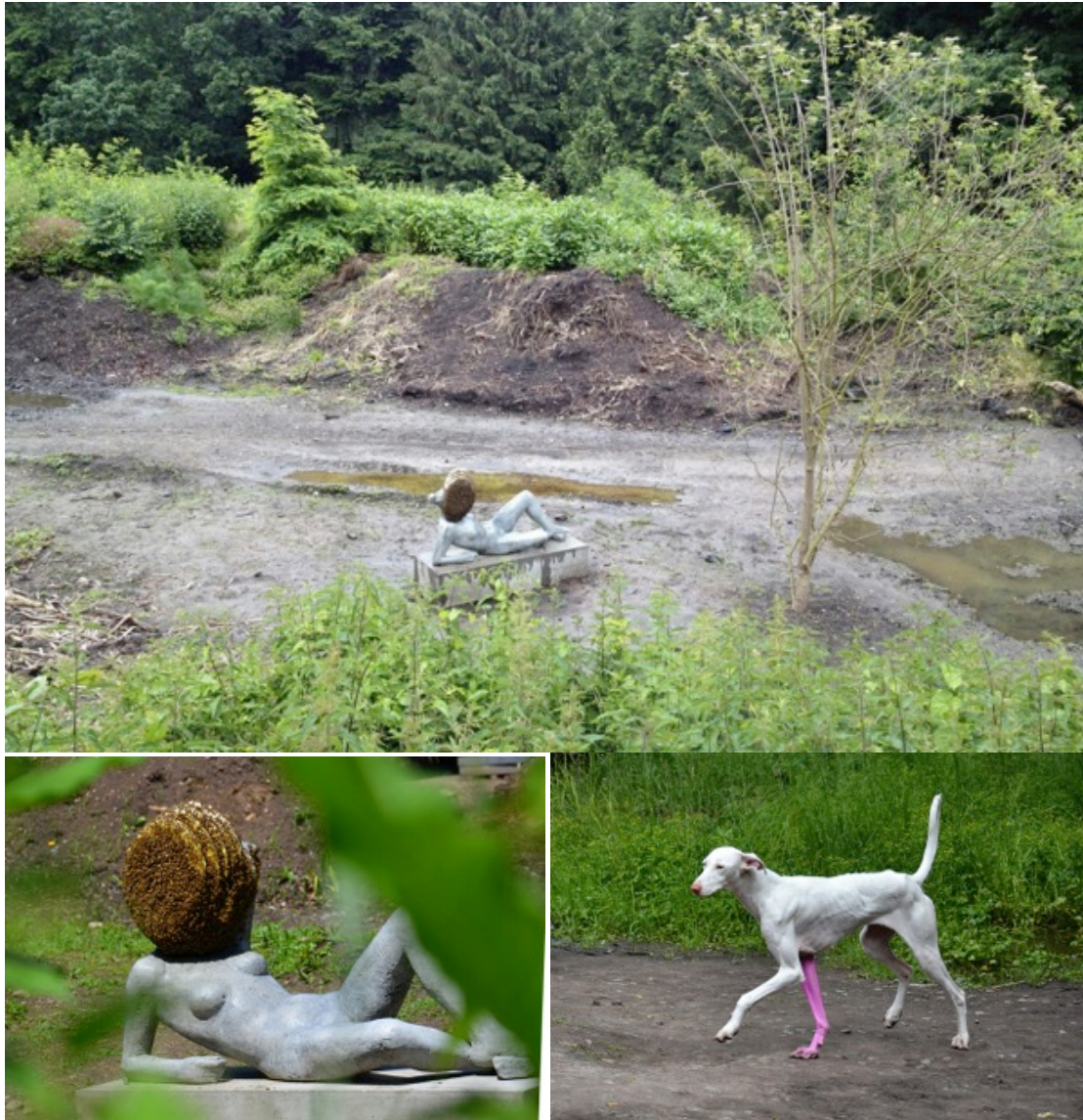
Figures 11-13: Pierre Huyghe's Untitled