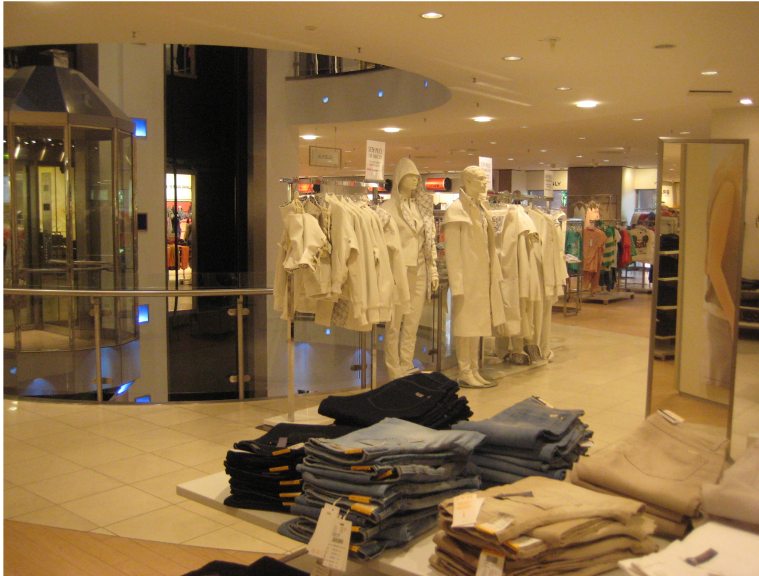
Figure 10: Seth Price and Tim Hamilton's Spring/Summer Collection on sale in the department store Kaufhaus Leffers, Photo: Barbara Wolbert.