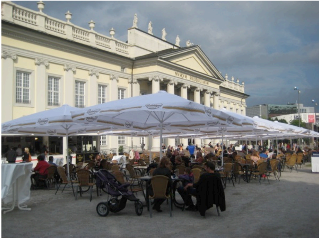
Figure 6: Restaurant in front of the Fridericianum, Photo: Barbara Wolbert.

Instead, what caught my eye were the white umbrellas advertising the beer Raderberger Pils in front of the local restaurant that obviously had been granted permission to serve visitors right in front of the Fridericianum (figure 6), only meters away from the tents of members of the occupy movement, which the director also gladly tolerated, as I remembered reading online or in a newspaper (see Geoffroy). A ‘sacred’ documenta site carelessly treated?