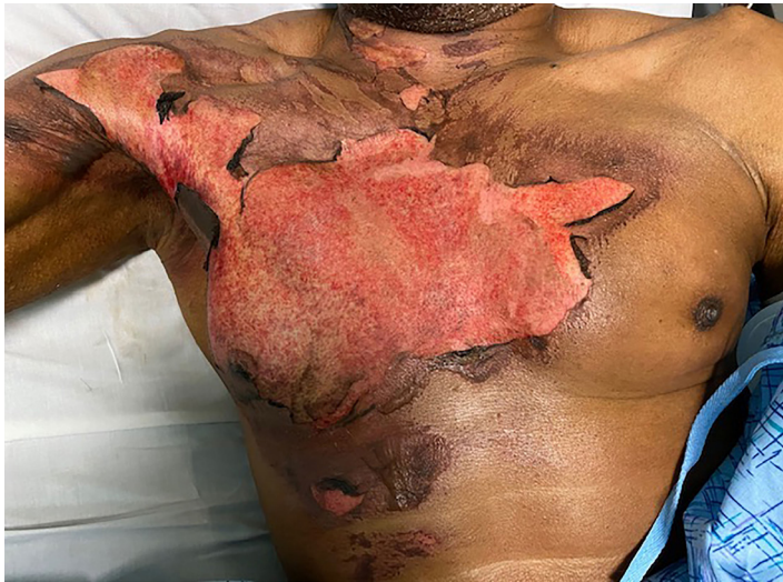
Image 1. Partial-thickness burn of the anterior chest wall in the patient prior to receiving bilateral serratus anterior plane blocks for pain.

A 72-year-old male with diabetic polyneuropathy presented to the ED with a chief complaint of chest pain two days after sustaining a flame burn while cooking. His vital signs were stable and his physical exam revealed a deep partial-thickness burn over the majority of his right pectoralis extending across midline to the left sternal border (Image 1). The patient reported severe thoracic pain (10/10) unrelieved with oral therapy consisting of NSAIDs and acetaminophen at home.