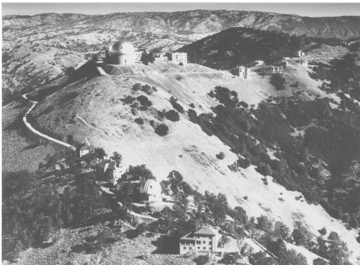
Aerial view of the Lick Observatory in the late 1920's