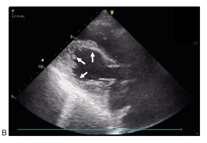
Image 1. Long-axis achocardiogram view at end-diastole (A) and end systole (B) on admission, showing apical ballooning (white arrows) in the left ventricle.