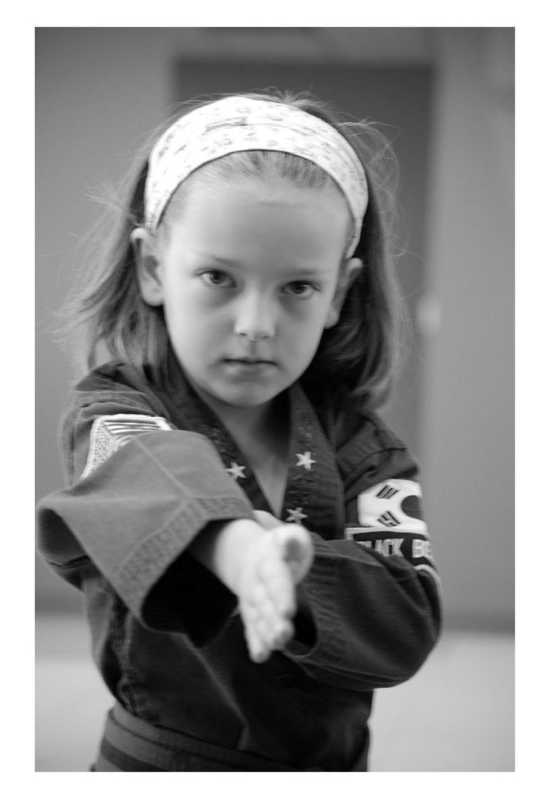
Figure 1. Child practicing a Taekwondo form.