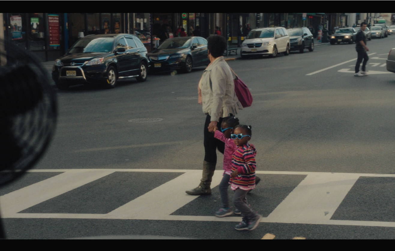
Figure 4: The mother and the daughters are unaware of the gaze ( Paterson , Amazon Studios and K5 International, 2016).