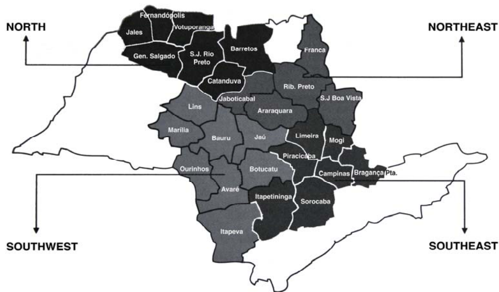
Fig. 1. Map of citrus growing regions from State of São Paulo, Brazil, from which the samples were collected and sent for HLB analysis.