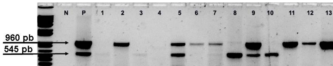
Fig. 2. Agarose gel electrophoresis DNA amplified with set of primers for Ca. Liberibacter asiaticus (960 bp) and for Ca. L. americanus (545 pb). Molecular marker - 1KB DNA size Ladder plus (Invitrogen). N - negative control. P - positive control infected with both liberibacters. 1, 3, 8, and 10 – samples infected with CLam. 2, 6, 11, 12, and 13 - samples infected with CLas. 5, 7 and 9 – samples infected with both bacteria, 4. non-infected sample.