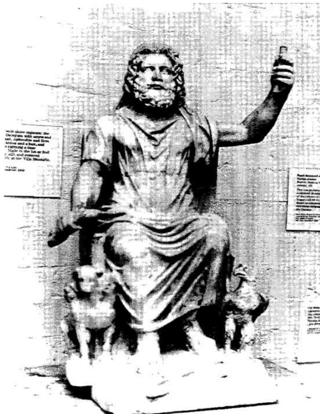
Cult-Statue of Jupiter: London, British Museum Source: Baharal, Plate XI, fig. 21.