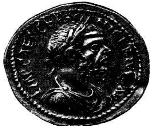
Top: Septimius Severus, aureus 193 and Didius Julianus, aureus 193. Middle: Septimius Severus, aureus 194 and Clodius Albinus, denarius 194-5. Bottom: Septimius Severus, aureus 193 and Pescennius Niger, aureus 193-4.