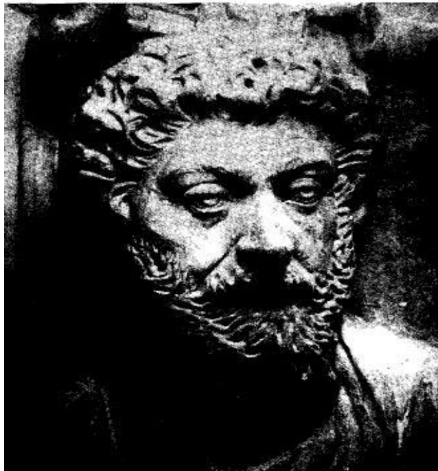
Top: Septimius Severus. Rome, Museo Nazionale Inv. 345 Bottom: Marcus Aurelius, detail from relief of Triumph of Marcus Aurelius