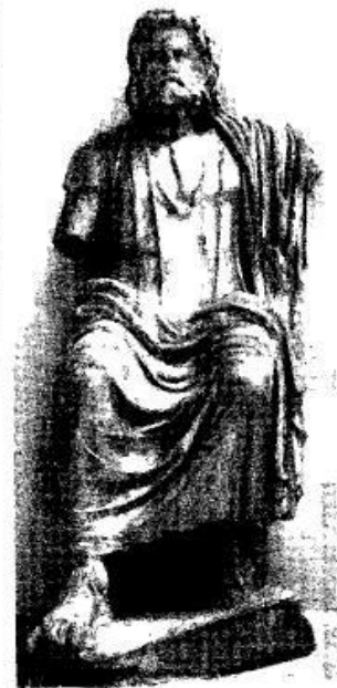
Top: Capitoline Triad. Lepcis Magna, arch of Severus Bottom: Septimius Severus, detail from Capitoline Triad with restored fragment. Lepcis Magna, arch of Severus and Serapis.