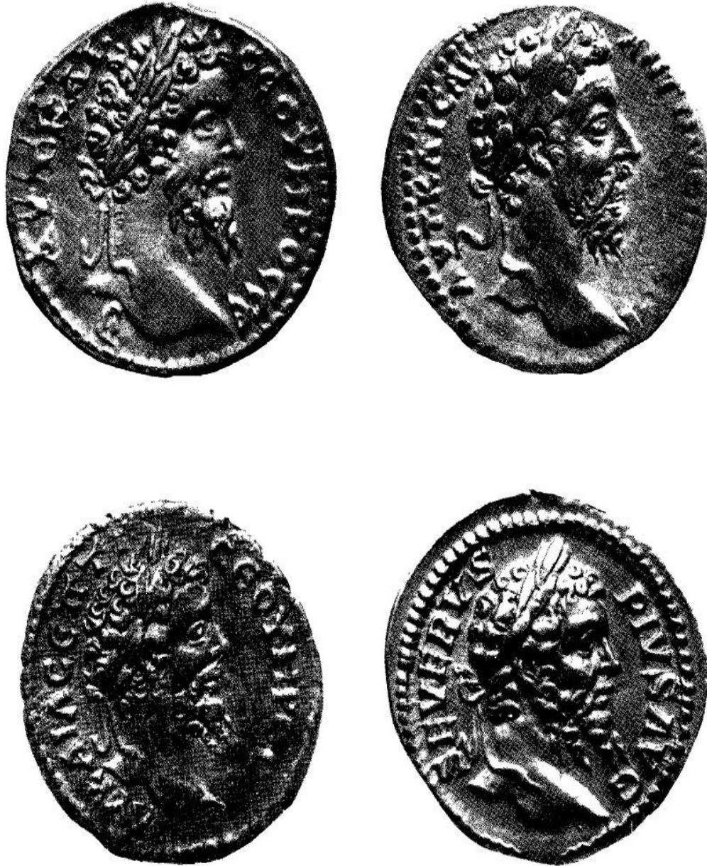
Top: Septimius Severus, silver coin 202 and Marcus Aurelius, silver coin. Bottom: Septimius Severus silver coin 206-7 and Septimius Severus, aureus 207.