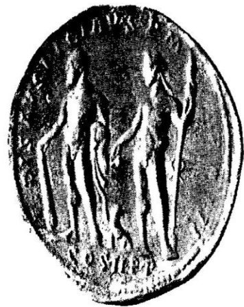
Left: Bronze Medallion of Commodus, Hercules Right: Bronze Medallion of Severus, Hercules and Liber