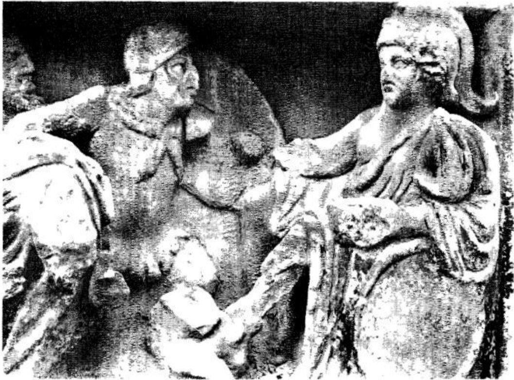
Top: Triumphal, register, on the west, right section.