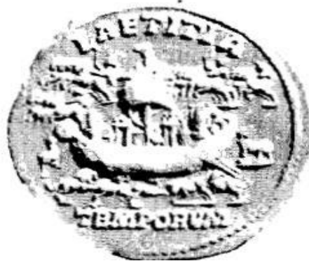
Top: Septimius Severus with aegis of Jupiter, aureus , 200-201 and detail of fig 1. Middle: Septimius Severus with aegis of Jupiter, aureus , 200-201 and aureus of Severus from 202. Bottom: Septimius Severus, bronze coin, 202-206 and Gaius Galerius Valerius Maximianus with animals-reverse of bronze coin.