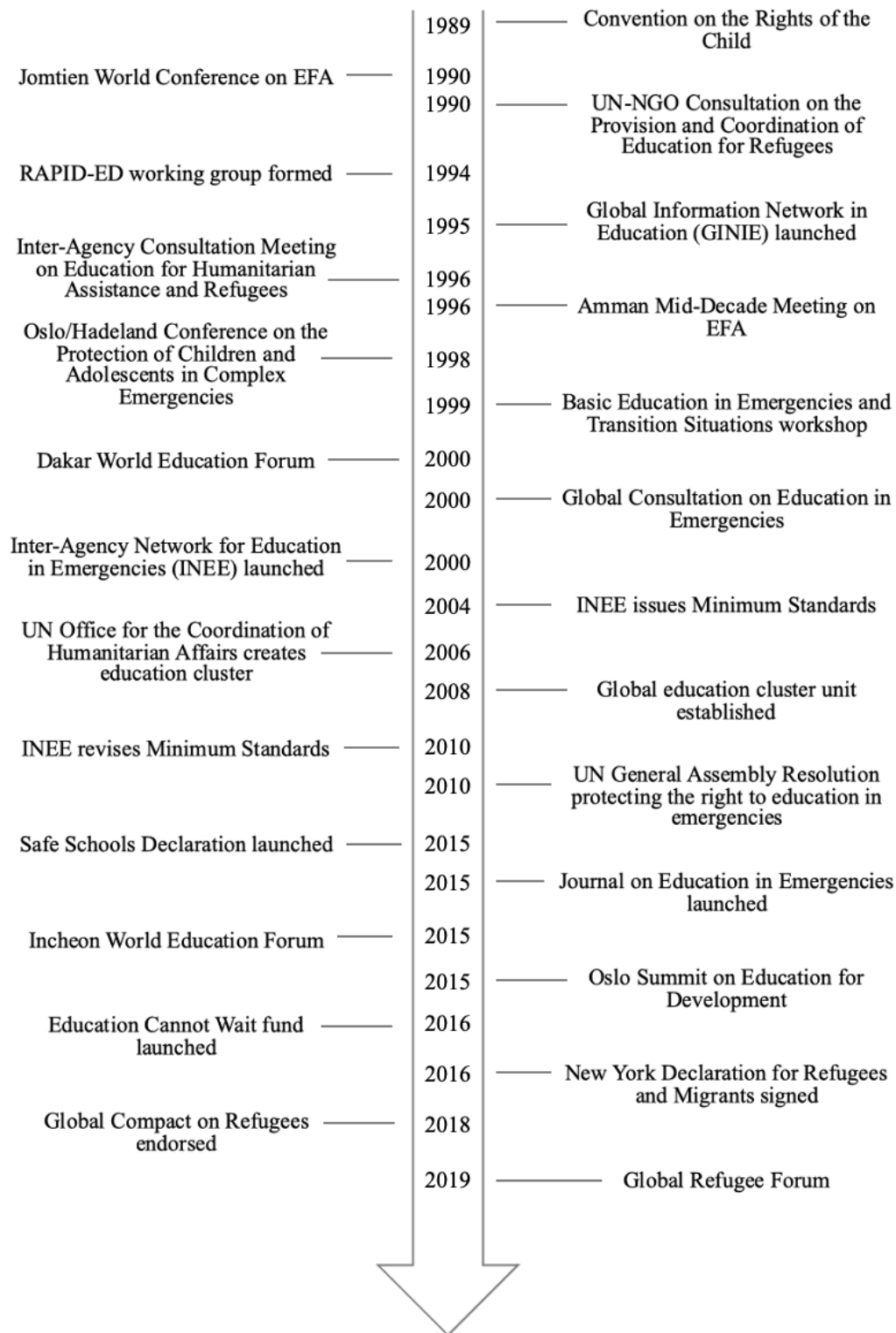
Figure 1. Illustrative Timeline of EiE-Related Initiatives and Relevant EFA events