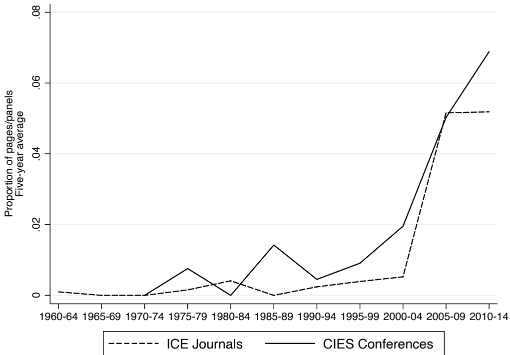
Figure 4. Education in Emergencies in select International Comparative Education (ICE) Journals and at the Annual Comparative and International Education Society (CIES) Conference

Notes: The line for “ICE Journals” presents five-year averages of the proportion of pages dedicated to EiE-related topics across an illustrative set of International Comparative Education (ICE) Journals: Comparative Education Review (founded in 1957), Compare (founded in 1975), Comparative Education (founded in 1964), and the International Journal of Educational Development (founded in 1981). For each journal, I combed through each year to identify all articles related to EiE by reviewing titles/abstracts for foci on educational issues during or after conflicts, disasters, displacement, and similar. I then summed the page lengths of all EiE articles across all journals for each year to get a measure of the total number of pages dedicated to EiE that year. To standardize this measure, I then summed the page lengths of all articles across all journals for each year and divided the total number of EiE pages that year by that sum.