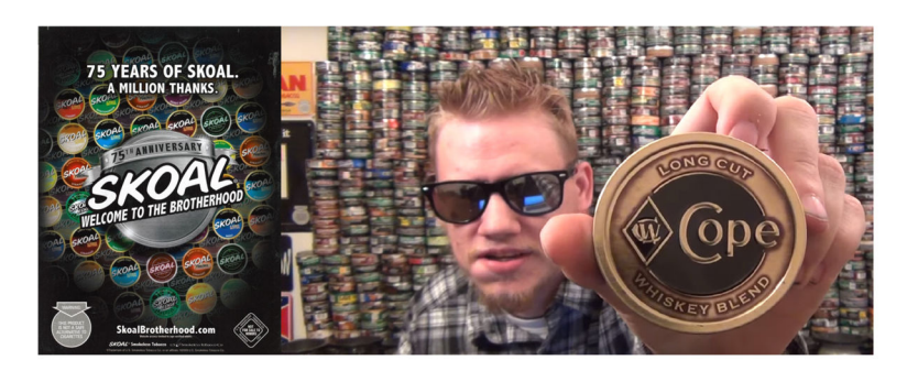
Figure 1. Proliferation of smokeless tobacco flavours: 75 years of Skoal advertisement. Reviewer video still shot. Smokeless tobacco reviews are frequently posted on Youtube.com and other websites by young males; this video was shot with a large array of flavoured smokeless tobacco cans in the background.